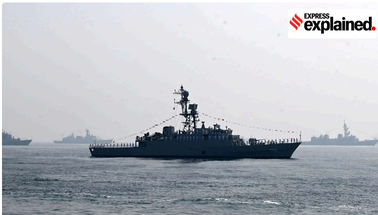
Iranian warship IRIS Dena is seen in the Bay of Bengal during International Fleet Review held at Visakhapatnam, India, Feb. 18, 2026.