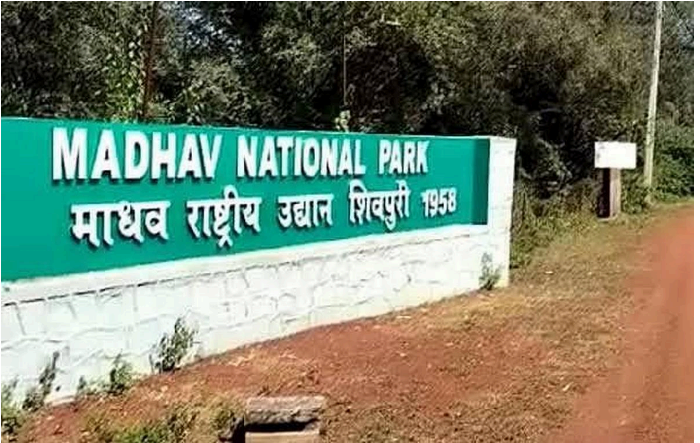
Madhav Tiger Reserve is Madhya Pradesh's 9th Tiger Reserve.

Located in the Shivpuri district in Chambal region, the reserve has five tigers at present, including the two cubs born recently. Two more tigers could be released into the reserve by Madhya Pradesh Chief Minister Mohan Yadav soon.