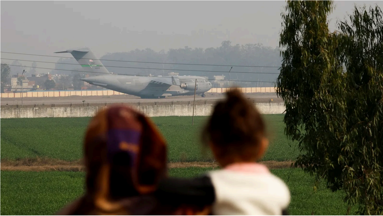
People look at the U.S. military plane deporting Indian immigrants as it lands in Amritsar