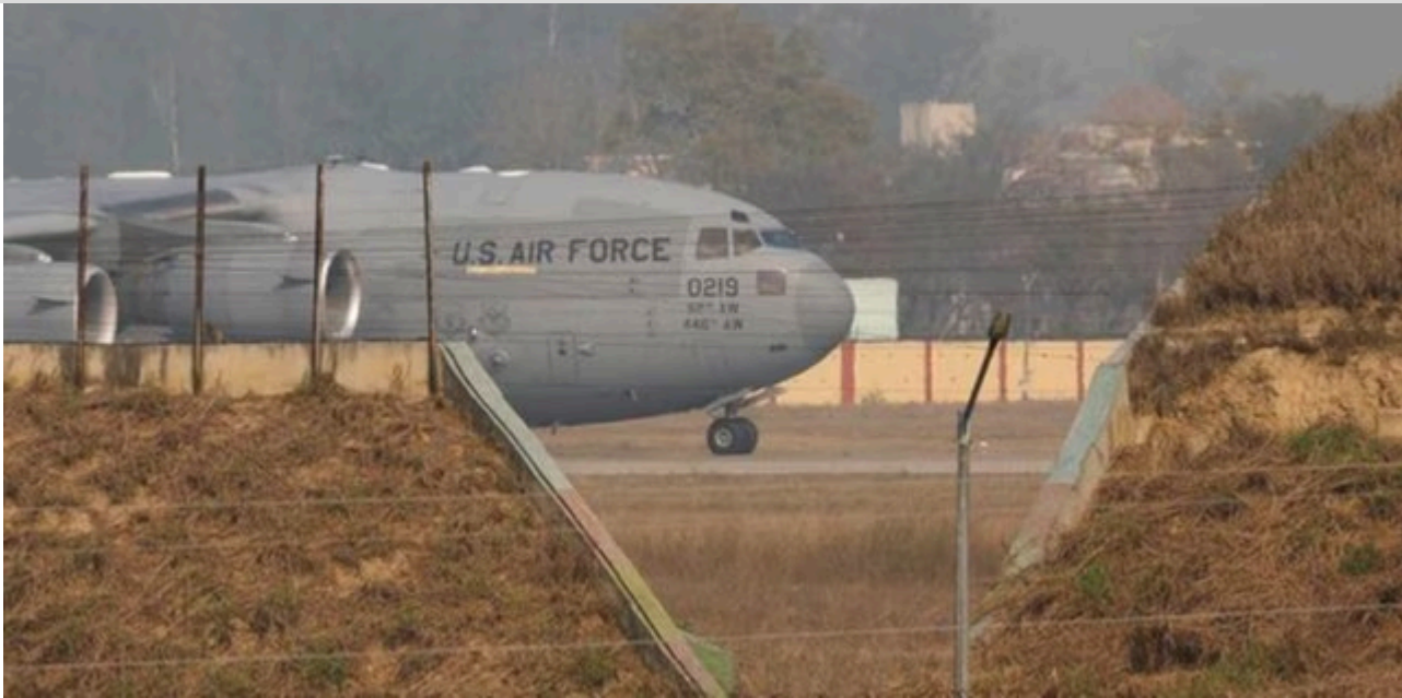
The US military plane deporting illegal immigrants from the country landed in Amritsar on Wednesday

At a time when the first batch of illegal Indian immigrants were deported from the US under the Trump 2.0 administration, the Indian government is “seriously considering” enacting a new law, tentatively titled ‘Overseas Mobility (Facilitation and Welfare) Bill, 2024’, to establish an enabling framework which will promote “safe, orderly and regular migration for overseas employment”.