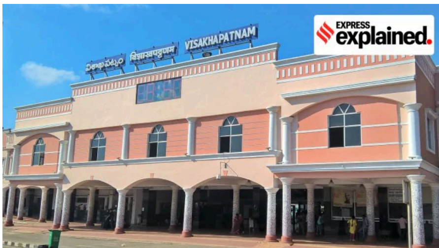
Under the 2014 Andhra Pradesh Reorganisation Act, Indian Railways was to examine establishing a new railway zone.

On Friday (February 7), the Union Cabinet ex post facto approved the plan to create the new South Coast Railway Zone. Prime Minister Narendra Modi laid the