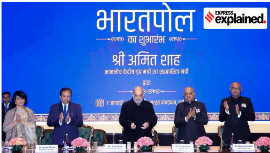
Union Home Minister Amit Shah during the launch of the 'BHARATPOL' portal, developed by CBI, in New Delhi.

Union Home Minister Amit Shah inaugurated the 'Bharatpol' portal on Tuesday (January 7), which aims to streamline international cooperation for law investigating agencies.