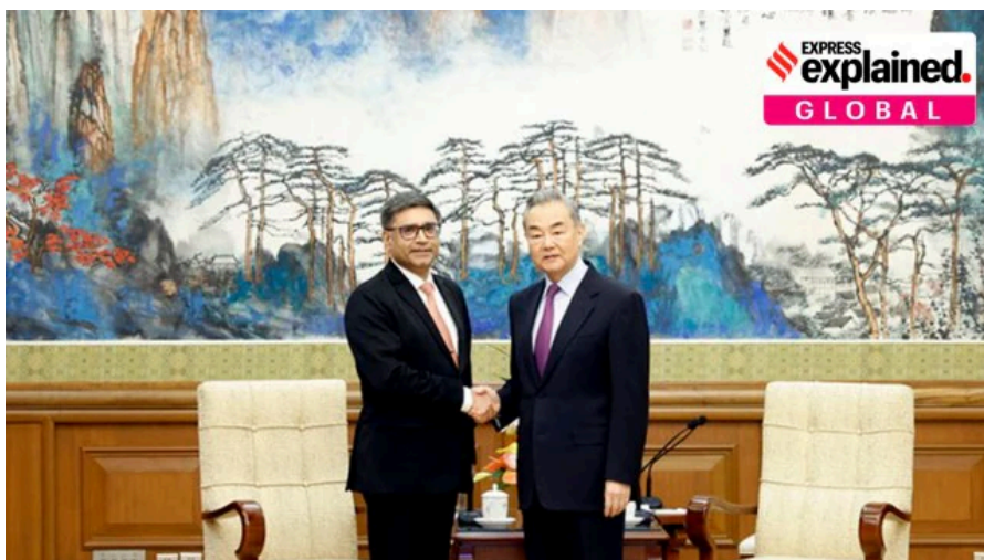
Chinese Foreign Minister Wang Yi and India's Foreign Secretary Vikram Misri during a meeting, in Beijing, Monday, Jan. 27, 2025.

In a major diplomatic breakthrough, New Delhi and Beijing have decided on a slew of measures to repair bilateral ties: resuming Kailash Mansarovar Yatra this summer, restoring direct flights between the two capitals, issuing visas for