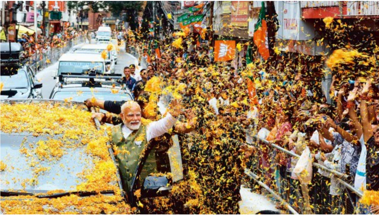
PM Modi during a roadshow in Reasi on Thursday. J&K's remaining two poll phases are on September 25 and October 1.

Prime Minister Narendra Modi Thursday said that India has introduced “wide-ranging” reforms to transform the food-processing sector in the last 10 years.