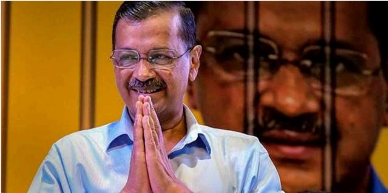
Supreme Court granted bail to Delhi Chief Minister Arvind Kejriwal on Friday.

Ending Delhi Chief Minister Arvind Kejriwal's nearly six-month stint in custody following his arrest first by the ED and later by the CBI for his alleged role in the Delhi excise policy case, the Supreme Court granted him bail Friday in the CBI case, observing that "completion of the trial is unlikely to occur in the immediate future" and that he "satisfies the requisite triple conditions for the grant of bail".