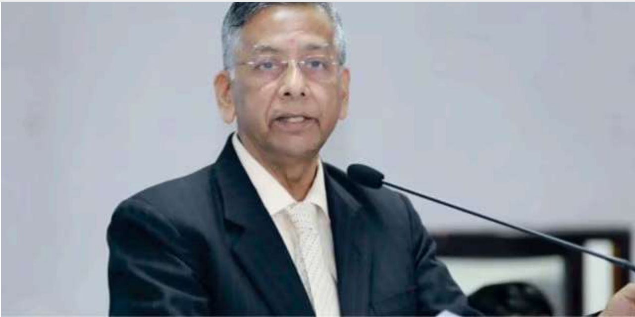
Attorney General R Venkataramani. (File photo)

Effectuation of fundamental duties is and will always be a continuing task, calling for duty-specific legislations, schemes and supervision, Attorney General R Venkataramani told the Supreme Court on Wednesday.