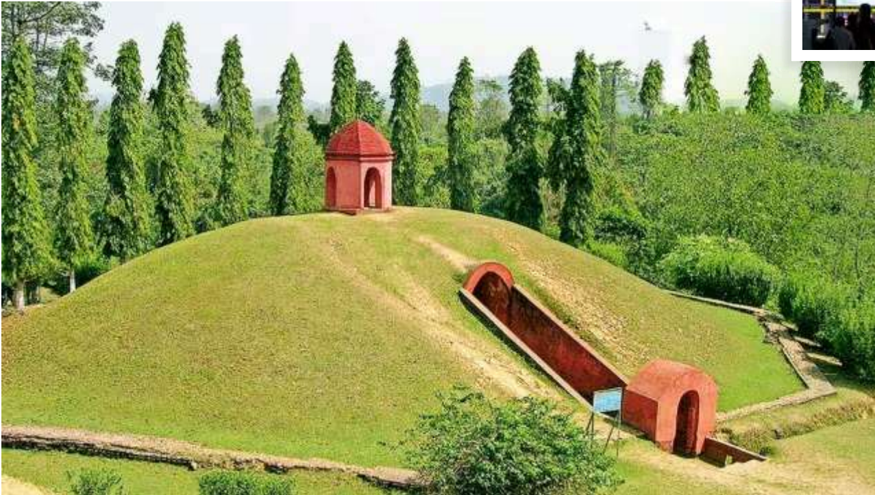
The Moidams in Assam. File picture

The 700-year-old mound-burial system of the Ahom dynasty — the Moidams from Assam — will be considered for nomination on the World Heritage List next week during the 46th session of the World Heritage Committee (WHC) in New Delhi on Sunday. If the nomination comes through, it will become the first cultural site on the prestigious list from the northeastern region.