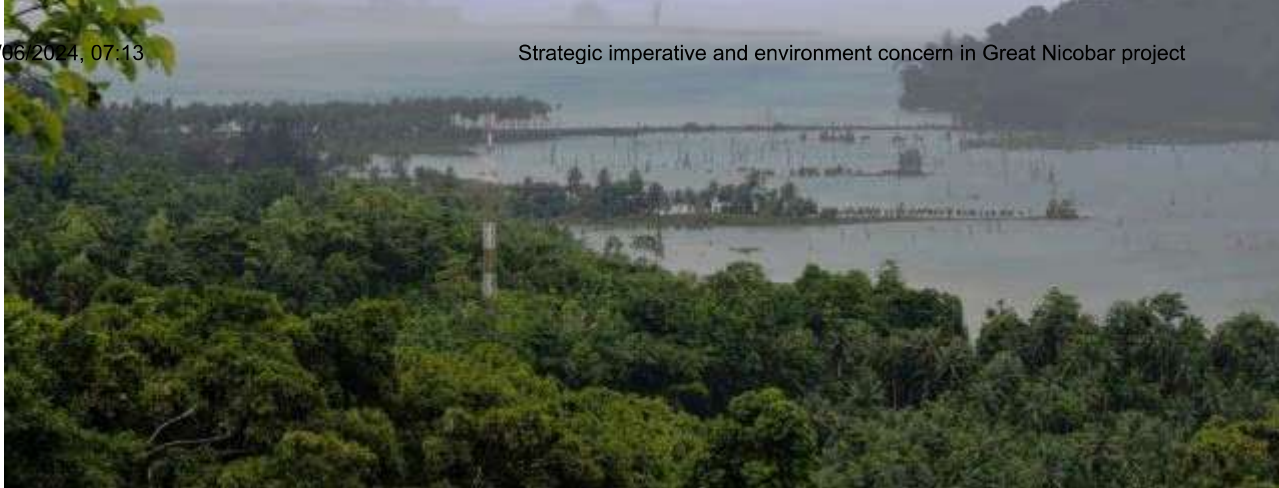
The Great Nicobar Biosphere Reserve.

The Congress party has described the proposed Rs 72,000-crore infra upgrade at the Great Nicobar Island as a “grave threat” to the island’s indigenous inhabitants and fragile ecosystem, and demanded “immediate suspension of all clearances” and a “thorough, impartial review of the proposed project, including by the Parliamentary committees concerned”.