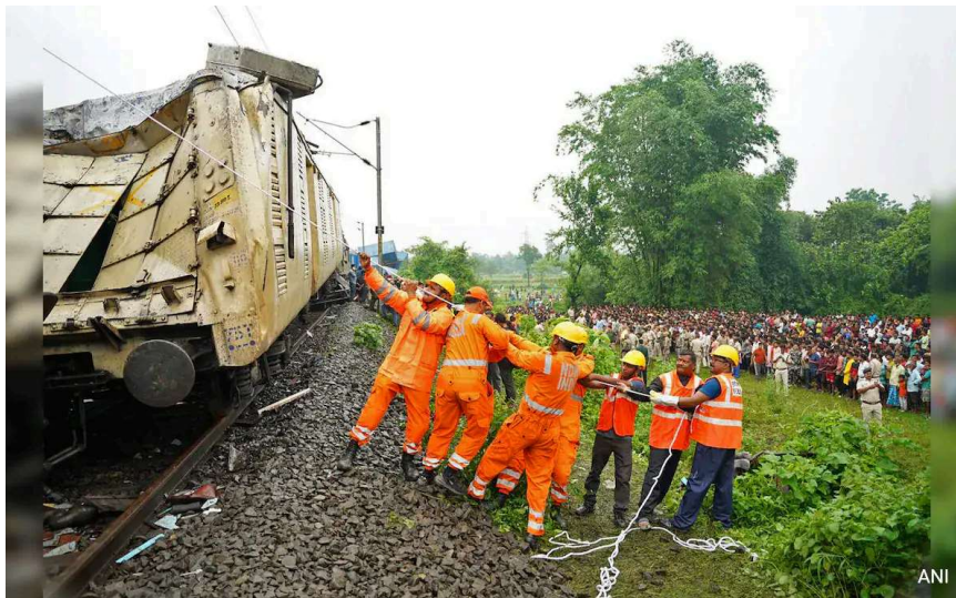
Railway Board did not give out the speed the goods train was travelling

Explore Deals On Home & Kitchen Appliances