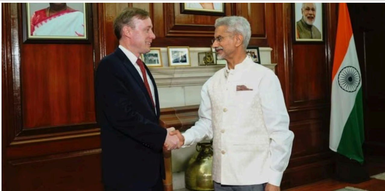
External Affairs Minister S. Jaishankar with National Security Advisor of United States Jake Sullivan during a meeting, in New Delhi, Monday, June 17, 2024.

In the first official visit from the US since Prime Minister Narendra Modi was re-elected for a third-term, US National Security Advisor Jake Sullivan met National Security Advisor Ajit Doval and agreed to strengthen cooperation in a range of areas — Defence technology, Space, Artificial Intelligence, High-Performance Computing, critical minerals among others.