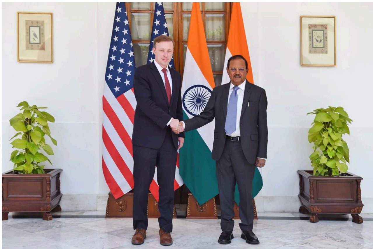
New Delhi: National Security Adviser (NSA) Ajit Doval and US NSA Jake Sullivan during a meeting, in New Delhi, Monday, June 17, 2024.

They underscored the vital importance of “adapting our technology protection toolkits and resolved to prevent the leakage of sensitive and dual-use technologies to countries of concern”.