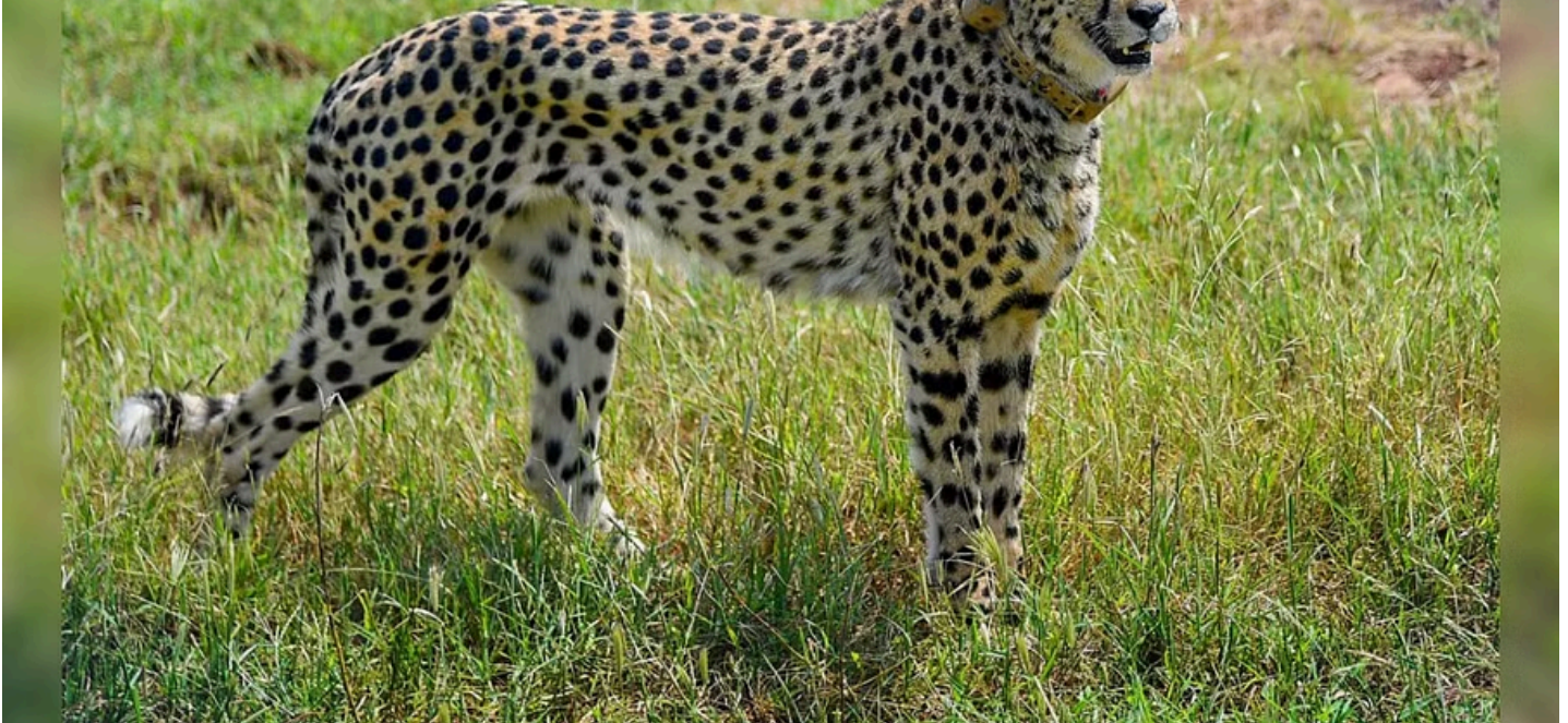
A cheetah inside a special enclosure of the Kuno National Park in Madhya Pradesh. Now, preparations have been made to bring in more cheetahs at MP's Gandhi Sagar Wildlife Sanctuary, which is set to be the state's second home for the animal.

Bhopal: The Madhya Pradesh government has completed preparations at Gandhi Sagar Wildlife Sanctuary, slated to be the second home for cheetahs, an official said on Tuesday.