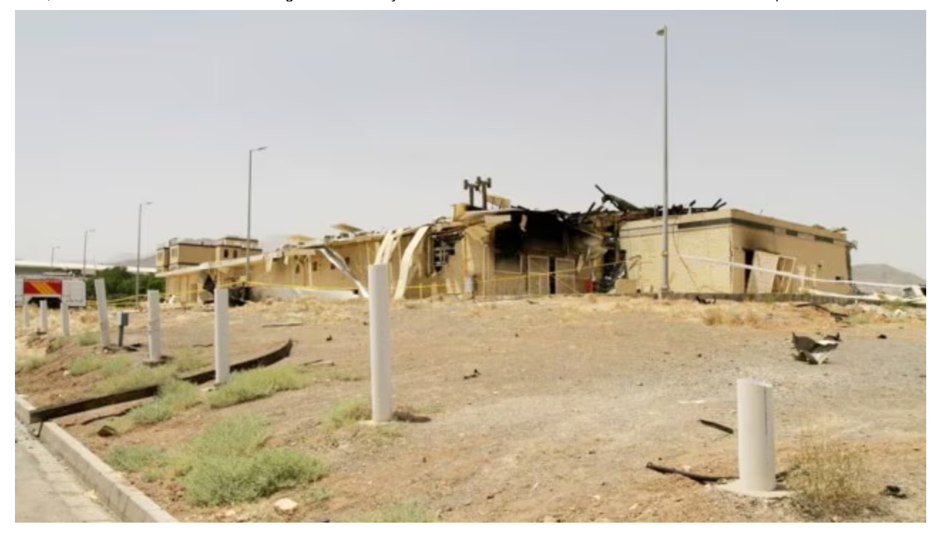
This file photo shows a view of a damage building after a fire broke out at Iran's Natanz Nuclear Facility, in Isfahan, Iran.

Conflicts in the Middle East deepened on Friday as Israel "launched attacks" on targets in Syria and Iran. Although Iran has said that three drones over the central city of Isfahan had been shot down and that there are no reports of a missile attack, a US official had confirmed about the strike.