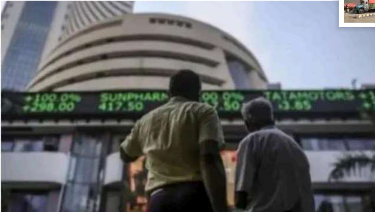
25 stocks eligible for same-day settlement (File Image)

India's Bajaj Auto, Bharat Petroleum and State Bank of India (SBI) are among 25 stocks eligible for optional same-day settlement starting from March 28, the Bombay Stock Exchange (BSE) said on Wednesday.