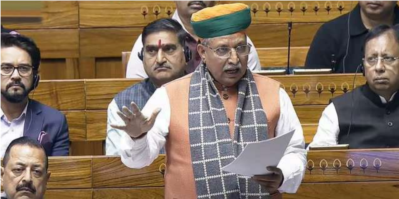
New Delhi: Minister of State Arjun Ram Meghwal speaks in the Lok Sabha during the Winter session of Parliament, in New Delhi, Tuesday, Dec. 17, 2024.

THE GOVERNMENT introduced two Bills in the Lok Sabha Tuesday as part of its plans for simultaneous elections across the country, countering the Opposition's charge of the move being "anti-constitutional" and "undermining federal structure". The Constitution (One Hundred and Twenty-Ninth Amendment) Bill and Union Territories Laws (Amendment) Bill were approved by the Cabinet last week.