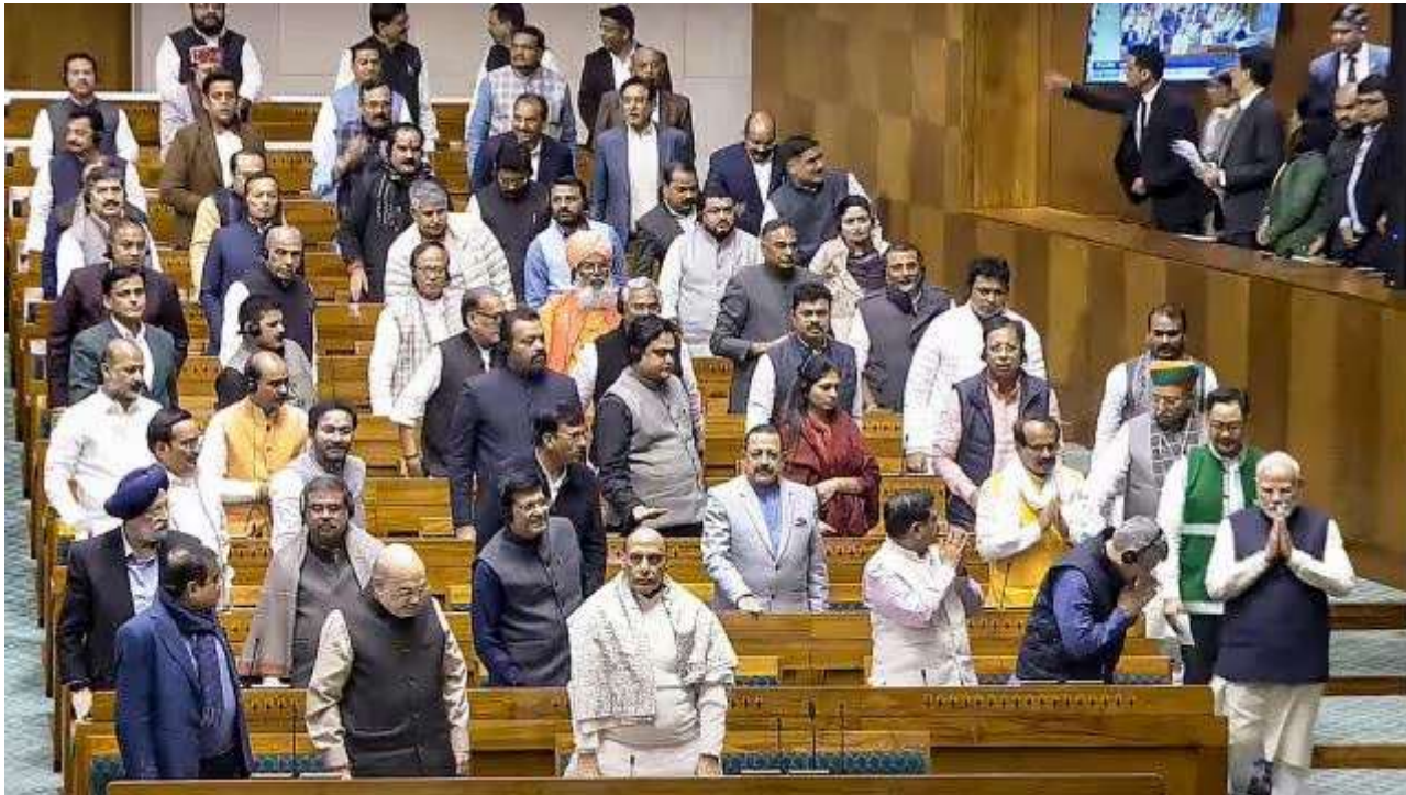
PM Narendra Modi arrives in Lok Sabha on Saturday.

Inspired by the Constitution and for the country's future, Prime Minister Narendra Modi proposed 11 pledges, including one on upholding existing reservations but strongly opposing introduction of any religion-based quota.