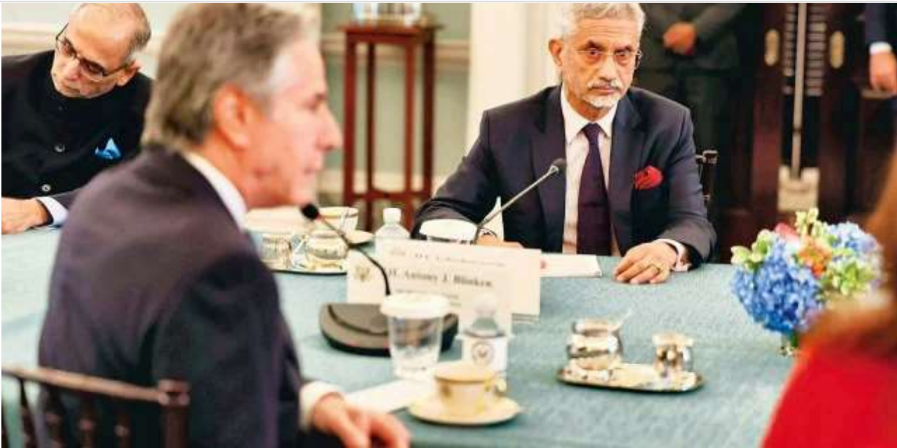
External Affairs Minister S Jaishankar with US Secretary of State Antony Blinken during their meeting in Washington DC.

As tensions soared across West Asia after Iran's missile barrage on Israel which threatened retaliation, External Affairs Minister S Jaishankar met US Secretary of State Antony Blinken and National Security Advisor Jake Sullivan in Washington DC and India, while calling for "restraint by all concerned and protection of civilians", advised all its nationals to "avoid all non-essential travel to Iran".