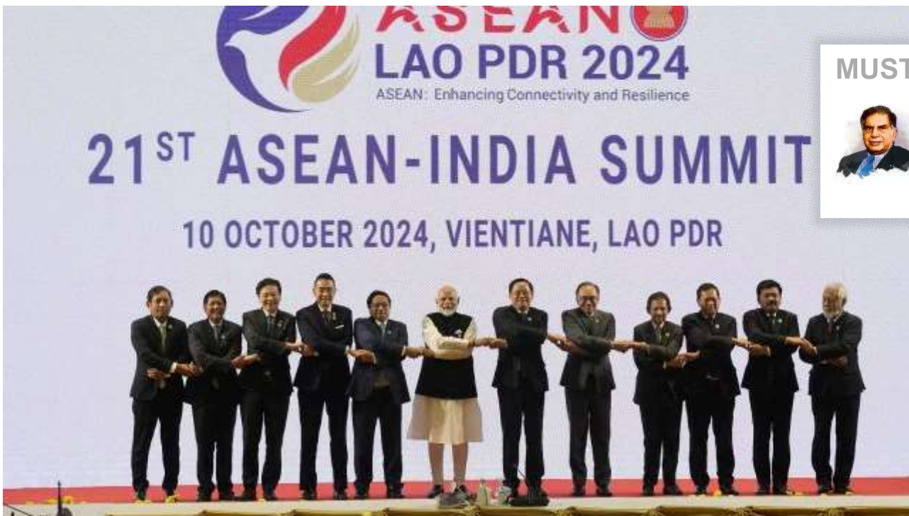
Prime Minister Narendra Modi at the 21st ASEAN-India Summit in Vientiane, Laos, on Thursday.