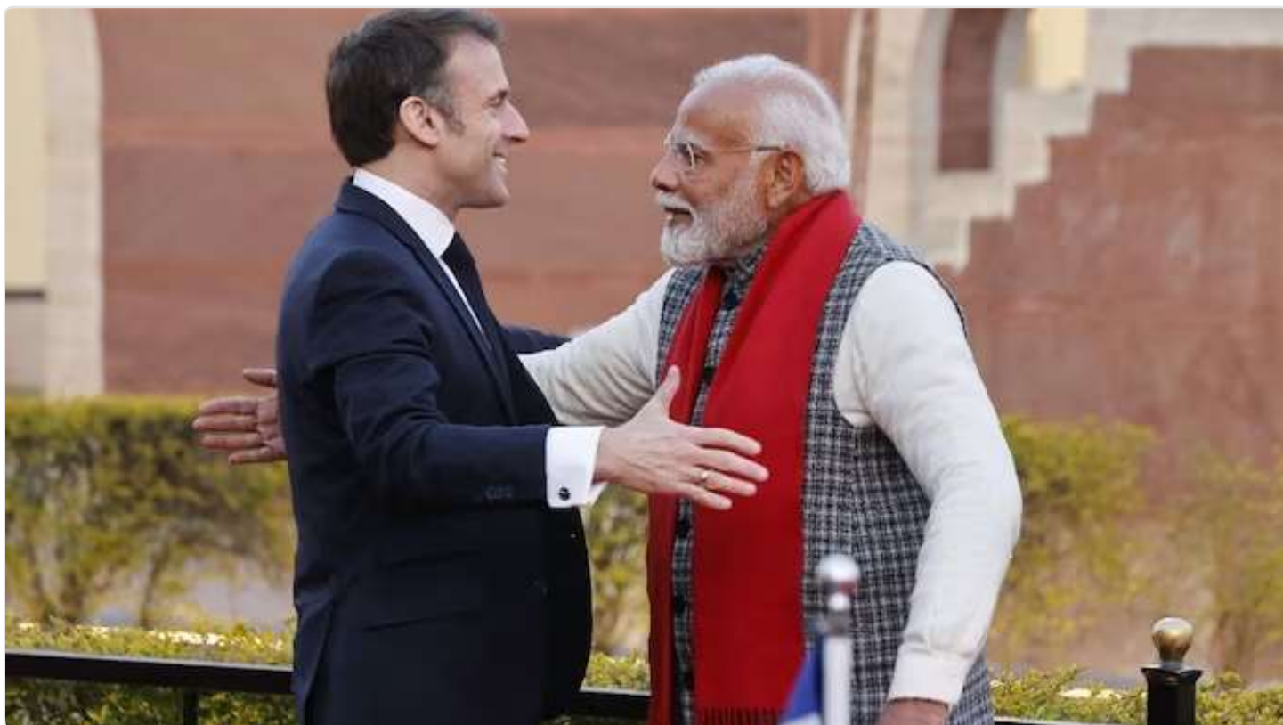
Prime Minister Narendra Modi and France's President Emmanuel Macron at the Janta Mantar observatory in Jaipur.