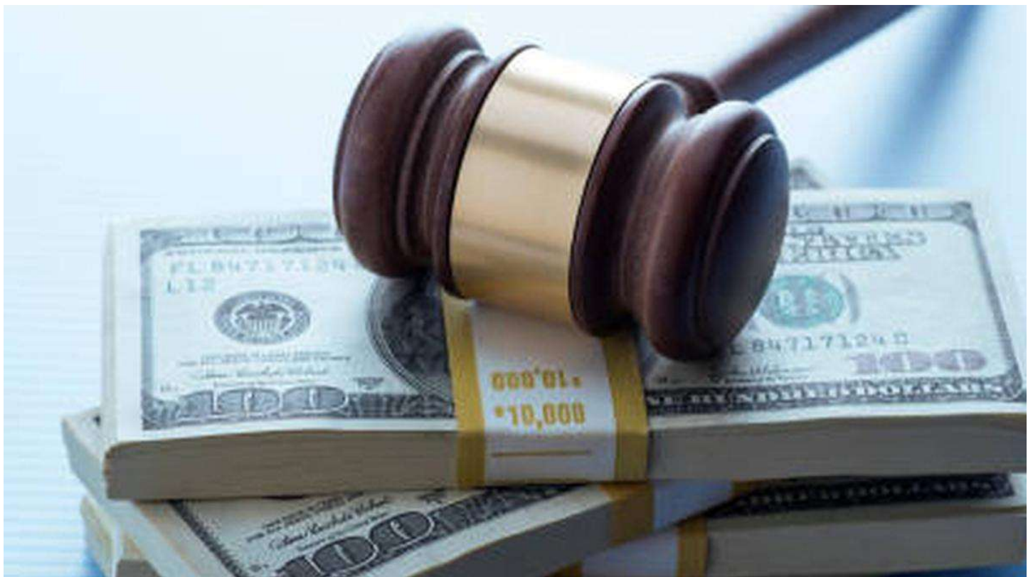
For representative purposes.