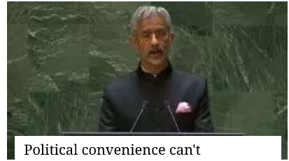
Political convenience can't determine response to terror: Jaishankar amid Canada row