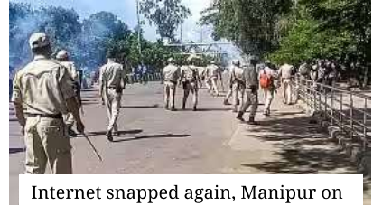
Internet snapped again, Manipur on edge as deaths of 2 Meitei youths are confirmed