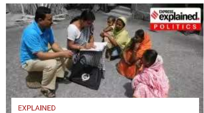
EXPLAINED Women's quota, gains for north India & BJP: Political issue of delimitation