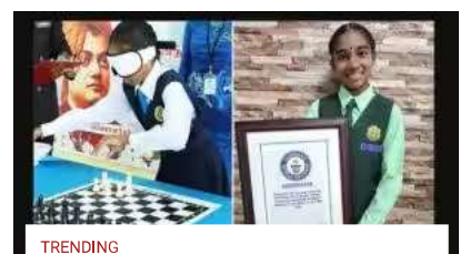
TRENDING Watch: Malaysian girl, 10, arranges chessboard in seconds while