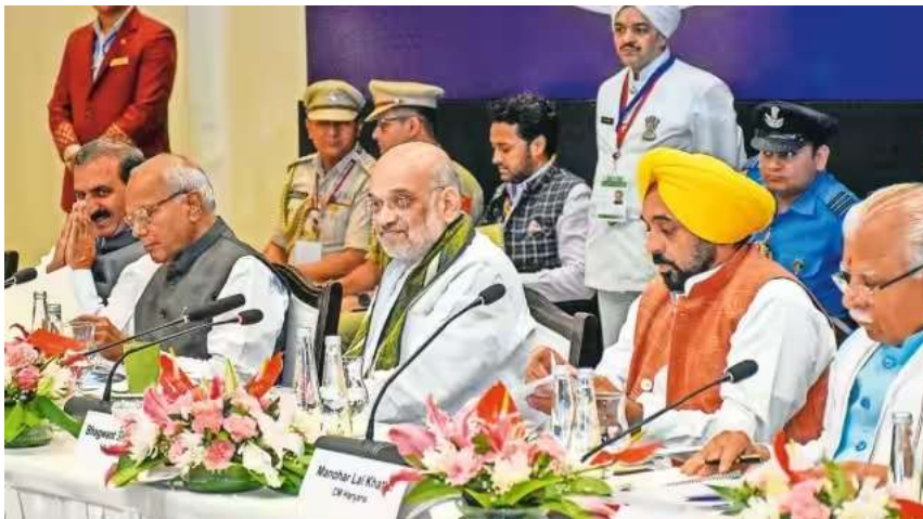
Union Home Minister Amit Shah with Punjab Governor Banwari Lal Purohit, Himachal Pradesh CM Sukhvinder Singh Sukhu, Punjab CM Bhagwant Mann and Haryana CM Manohar Lal Khattar in Amritsar on Tuesday.