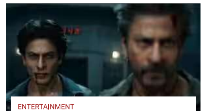
ENTERTAINMENT Jawan box office collection day 19: Shah Rukh Khan's film rages on, to beat Pathaan's worldwide gross record this week