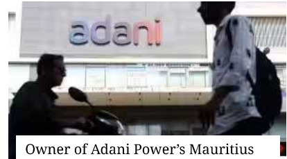
Owner of Adani Power's Mauritius investor a 'single person company'