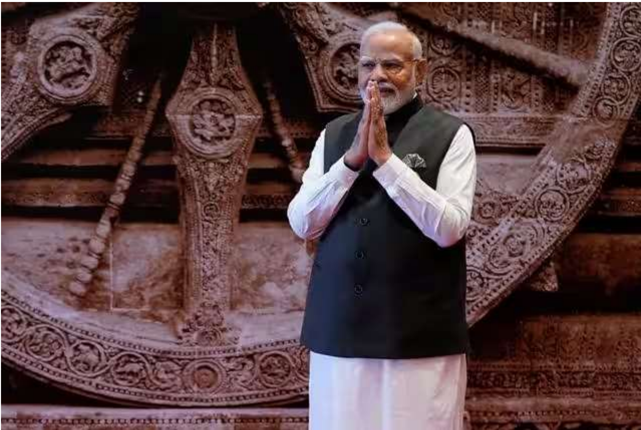
Indian Prime Minister Narendra Modi greets as waits to welcome leaders of the G20 countries, in New Delhi, India, Saturday, Sept. 9, 2023.