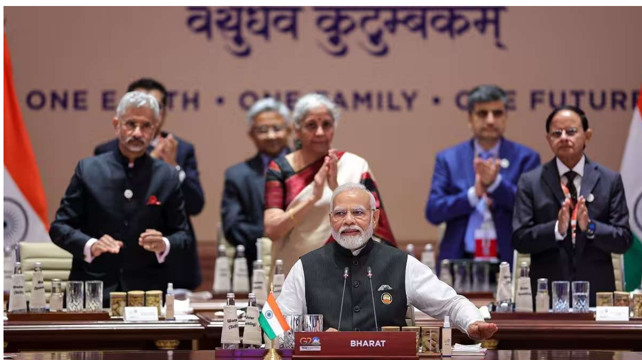
Prime Minister Narendra Modi at the Session-2 on 'One Family' during the G20 Summit 2023 at the

As a G7 diplomat put it, “to achieve a language of consensus on a subject as divisive as Ukraine , we had to be able to reaffirm what we said in Bali, which we have done by recalling the Bali conversation; we had to refer to the United Nations texts, which are indeed mentioned; and then we had to affirm a few obvious points for us, but which are not necessarily obvious for everyone, i.e., that a war of territorial conquest is unacceptable, that the sovereignty and territorial integrity of states must be respected, and that a just and lasting peace must respect these principles”.