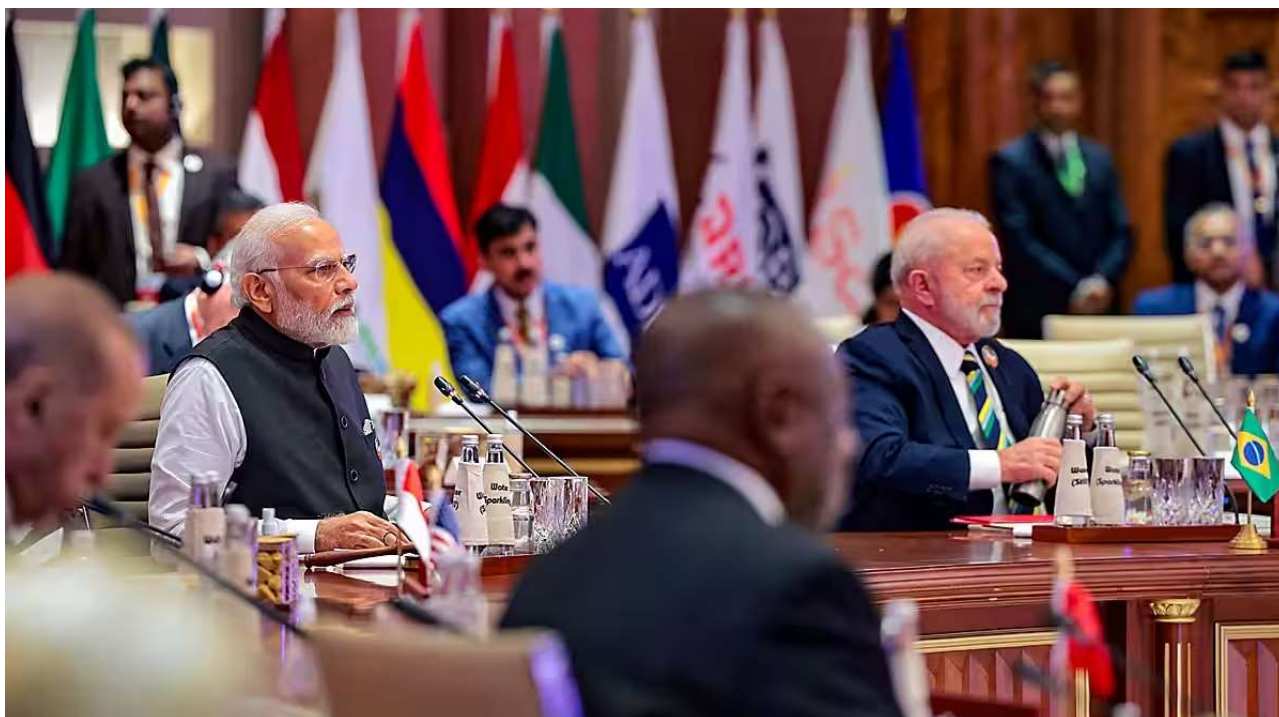
Prime Minister Narendra Modi during Session-2 on 'One Family' of the G20 Summit 2023 at the Bharat Mandapam, in New Delhi, Saturday, Sept. 9, 2023.

But, brick-by-brick, through many conversations over countless coffees, and hours of painstaking negotiations, the two sides built a consensus formula, with the help of four diplomats, and guided and led by Sherpa Amitabh Kant, External Affairs Minister S Jaishankar, and Finance Minister Nirmala Sitharaman .