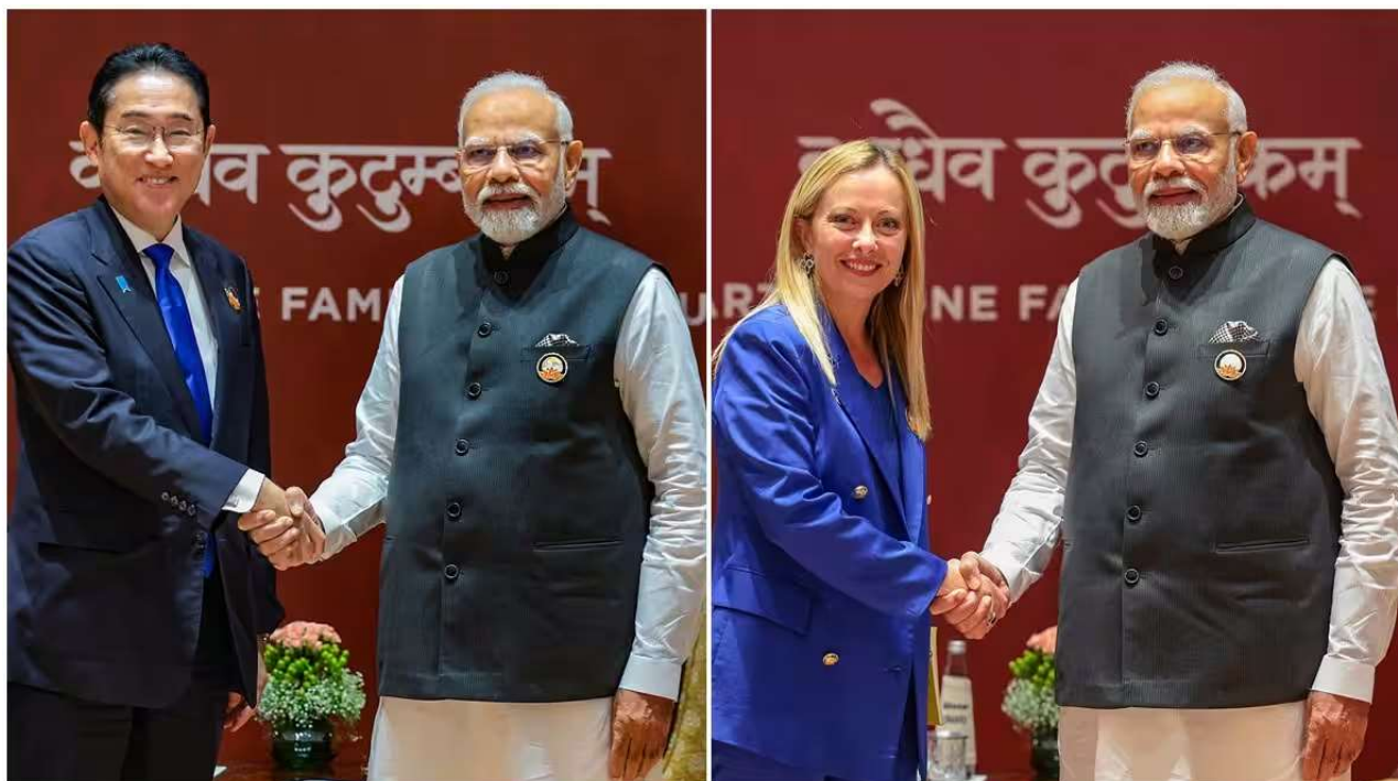
Prime Minister Narendra Modi with his Japanese and Italian counterparts Fumio Kishida and Giorgia Meloni during bilateral meetings, on the sidelines of the G20 Summit 2023, in New Delhi .