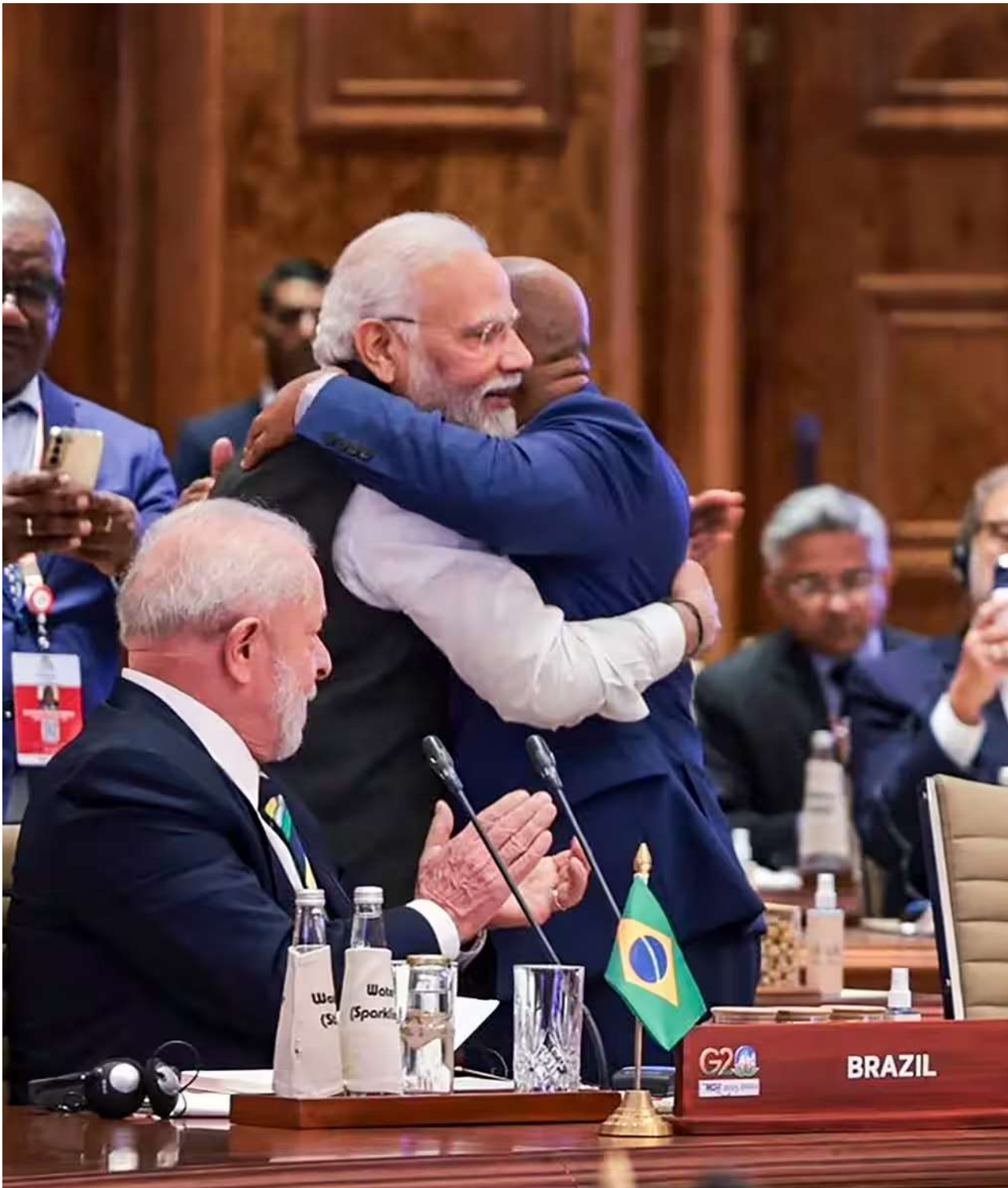
Prime Minister Narendra Modi greets President of the Union of the Comoros and Chairperson of the African Union (AU) Azali Assoumani after the Union became permanent member of the G20.

One of the important elements is on how future pandemics can impact the economy, which also brings out the gaps in the existing pandemic response mechanism, including institutional and funding arrangements.