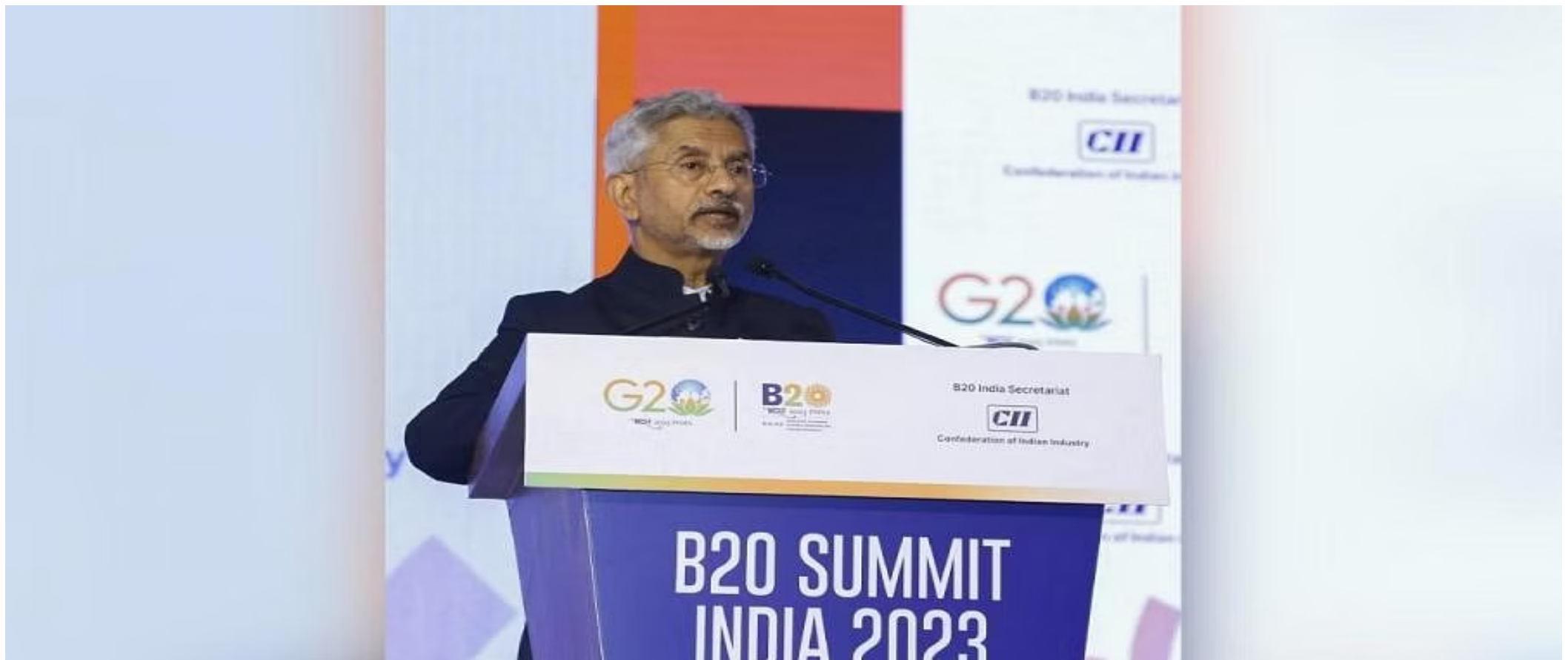
EAM S Jaishankar addresses a session on 'Role of Global South in Emerging World 2.0' at the B20 Summit India 2023, in New Delhi, Sunday, Aug. 27, 2023.