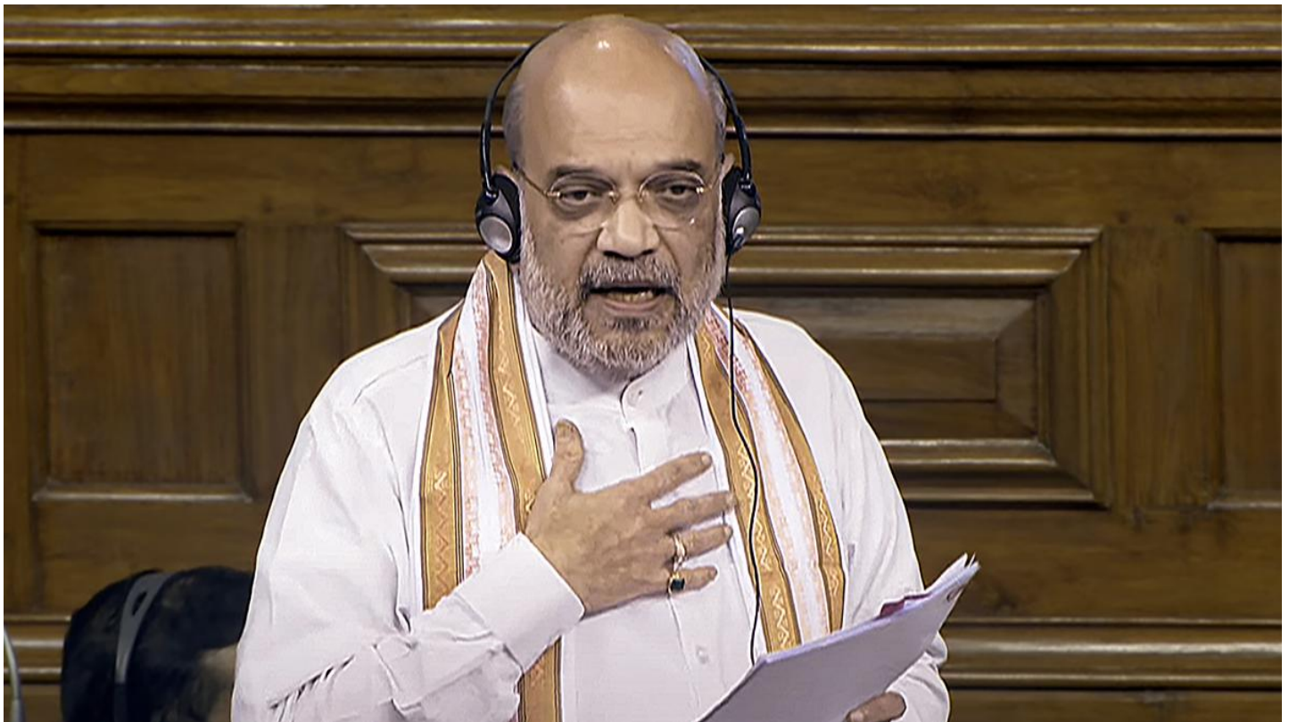
Amit Shah

The Multi-State Cooperative Societies (Amendment) Bill, 2023, which seeks to strengthen cooperatives by making them transparent and introduces a system of regular elections