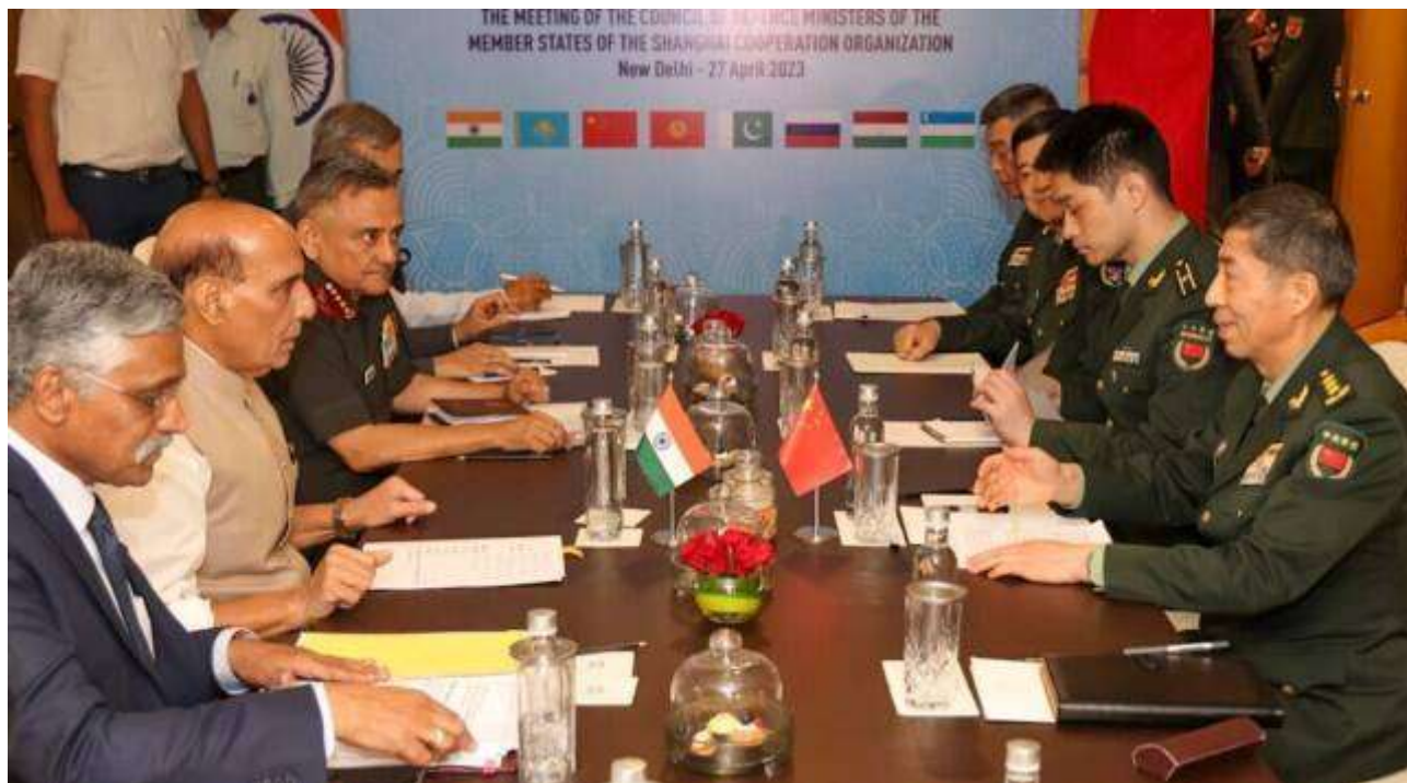
The talks between Union Defence Minister Rajnath Singh and his Chinese counterpart Li Shangfu in