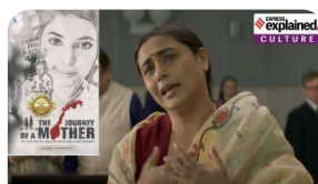
The true story behind Rani