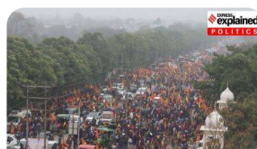
Protests in Punjab for release of