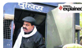
Who is Atiq Ahmed, former MP