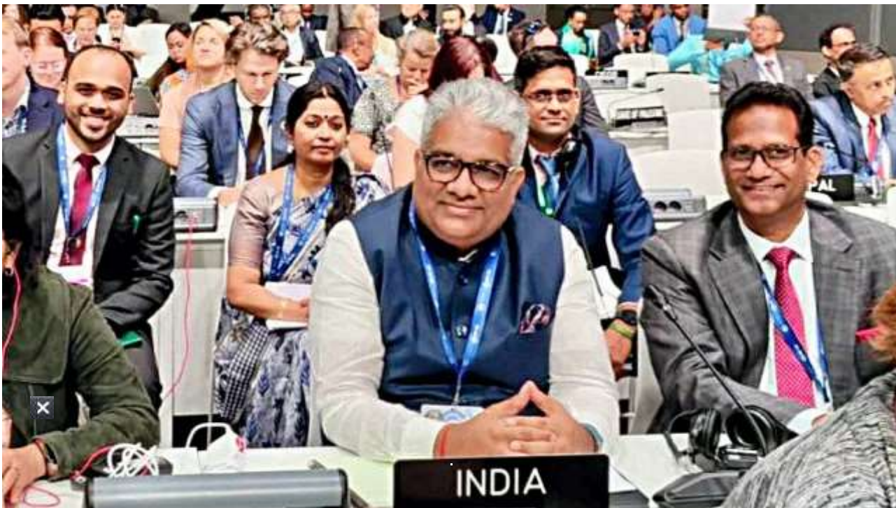
Union Minister for Environment, Forest & Climate Change Bhupender Yadav during the first day of the COP28 climate conference, in UAE, Thursday, Nov. 30, 2023.

India's climate actions were rated the fourth strongest in an annual performance index released by Germanwatch, a non-government organisation based in Bonn, Friday, marking an improvement of one place from the previous year. The Climate Change Performance Index ranks 59 countries and the European Union every year on their performance on climate actions.