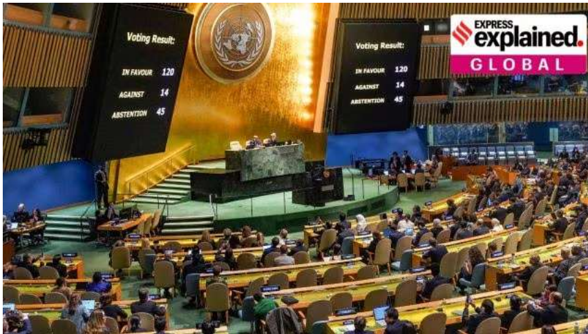
Voting results are displayed as the United Nations General Assembly voted on a nonbinding resolution calling for a "humanitarian truce" in Gaza and a cessation of hostilities between Israel and Gaza's Hamas rulers.