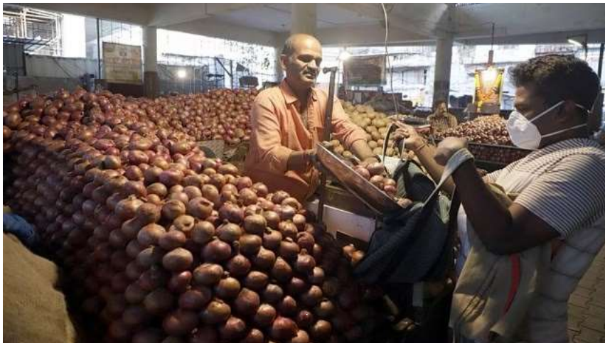
The MEP would be in place till December 30, 2023, read a Press Information Bureau (PIB) statement.