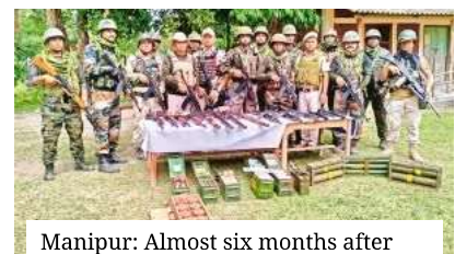
Manipur: Almost six months after clashes began, only 25% of looted arms found