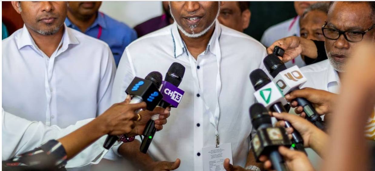
Mohamed Muizzu, Maldives presidential candidate of the opposition party, People's National Congress speaks with the media personnel during the second round of a presidential election in Male, Maldives September 30, 2023.

COLOMBO, Oct 27 (Reuters) - Maldives has started negotiations with India to remove its military presence, President-elect Mohamed Muizzu said in an interview published by Bloomberg News on Friday, as New Delhi and Beijing both vie for influence in the region.