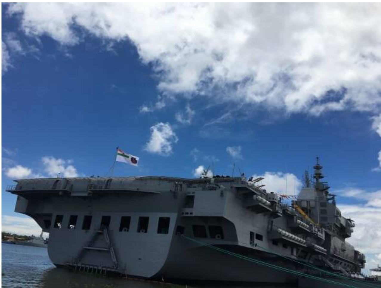
INS Vikrant and Navy's new ensign in one frame at Cochin Shipyard after the commissioning ceremony on Friday.

In a bid to do away with the “colonial past”, the Saint George’s Cross has been removed from the Indian Navy’s new flag. Instead, it now features the national emblem with the Tricolour on the upper canton (top left corner of flag). The national emblem is encompassed by an octagonal shield and sits atop an anchor. Beneath it is the Navy’s motto ‘Sam No Varunah’.