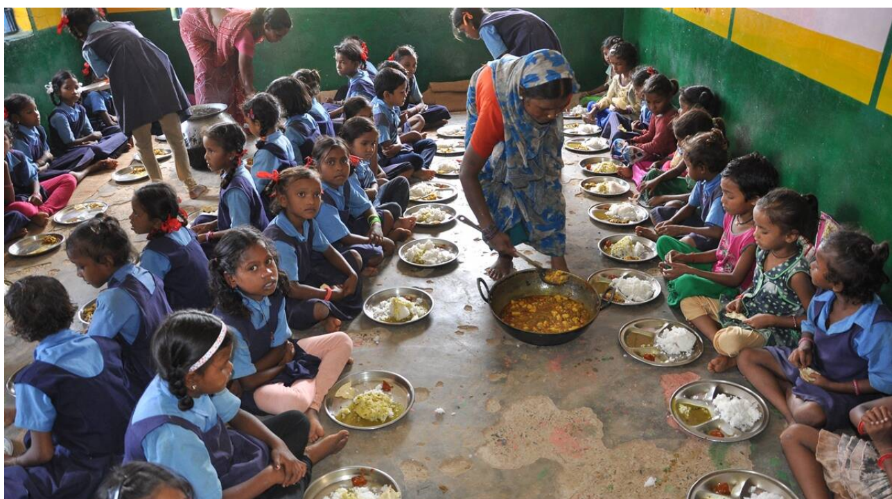
Social audit of the mid-day meal scheme can help detect irregularities. (File Photo)