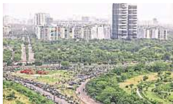
Traffic along the Noida-Greater Noida expressway and other areas was monitored via CCTV footage.