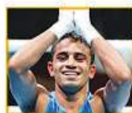
AMIT PANGHAL GOLD IN BOXING