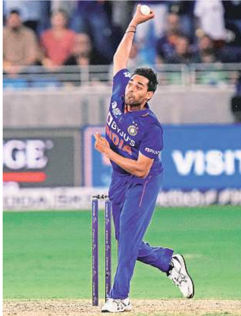
Bhuvneshwar Kumar bowled just one short ball in his first spell — and that fetched the wicket of Pakistan skipper Babar Azam.

Therein lies the glorious irony of India's late