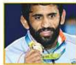
BAJRANG PUNIA GOLD IN WRESTLING