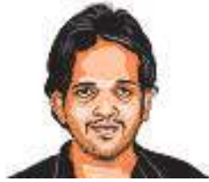
EXPRESS IN UAE

India's pacers take all 10 wickets using an effective short ball strategy to put behind last year's wicketless outing in World Cup