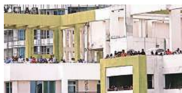
Residents watch the demolition, Sunday.