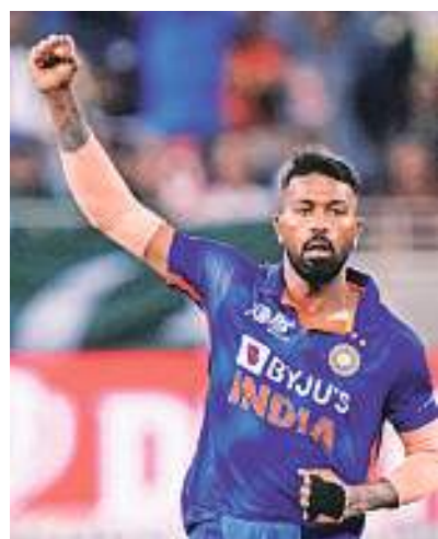
Hardik Pandya celebrates the dismissal of Pakistan's Iftikhar Ahmed.

Edged a wide one, dropped. Flirted with a well-outside off ball, missed. Inside-edge,