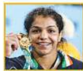
SAKSHI MALIK GOLD IN WRESTLING

Among the other states of the country, Haryana gives the maximum cash prize money to medal-winning players. A Haryana State Development Fund has been formed to provide cash prizes and other facilities to the medal-winning players in the state. Cash prizes worth more than Rs 335 crore have been provided to sportspersons. In the Olympic Games, a cash prize of Rs 6 crore was awarded to the gold medalists, Rs 4 crore for the silver medalist and Rs 2.5 crore for the bronze medalist. Haryana is the first state in the country, which has made arrangements to give an advance amount of Rs 5 lakh to the player for preparation as soon as they qualify for the Olympic and Paralympic Games. Medal winners in Paralympics and Olympic, Asian and Provision Games have also been given cash prizes. The cash award for sportspersons with disabilities is at par with able-bodied sportspersons. A new policy has also been implemented for the mountaineers of the state who climb the world's 10 highest mountain peaks. The climbers will be given a cash prize of Rs 5 lakh and a Grade-C certificate in the sports category.