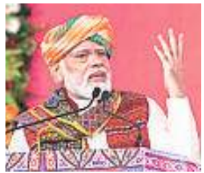
PM Narendra Modi in Bhuj on Sunday.