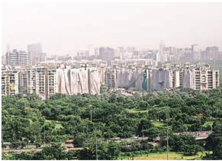
2.38 pm The skyline after the demolition. Gajendra Yadav