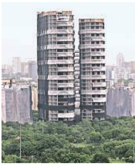
2.22 pm Before demolition. Tashi Tobgyal