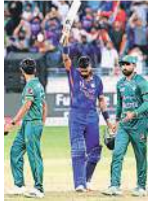
Hardik Pandya after India won the match.

INDIA WERE within touching distance, requiring just seven runs off five balls. But nerves could still jangle, and it nearly did, as they eked out only one run off two balls. The old-timers could sense a Javed Miandad-