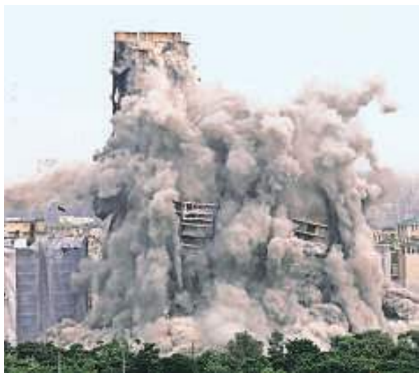
2.30 pm The towers being demolished. Tashi Tobgyal