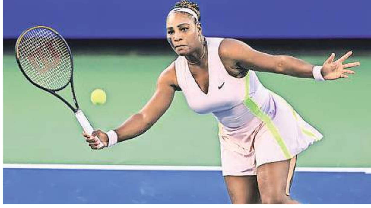
By 2007, Williams had already won seven Majors - four in a row between 2002-03 - which would have put her among some of the greats of the game.

The same can be said about the men - both pre-US Open Masters tournaments were won by unseeded players - but in Rafael Nadal, who remains unbeaten at the Grand Slams this year, there is a clear favourite. In Carlos Alcaraz, there is a teenage sensation to support, and in Daniil