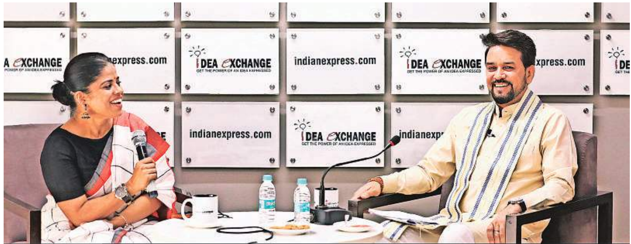
Anurag Thakur, Union Minister for Information and Broadcasting, Youth Affairs and Sports, in conversation with Liz Mathew, Deputy Political Editor, The Indian Express Abhinav Saha

Union Minister for Information and Broadcasting, Youth Affairs and Sports, Anurag Thakur, on AAP and its contentious excise policy, consolidation of corporate power in the media, and dynasty politics. The session was moderated by Deputy Political Editor Liz Mathew