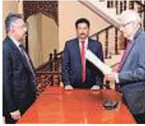
Ranil Wickremesinghe takes oath as Acting President in Colombo on Friday.

Former Prime Minister Wickremesinghe's remarks came after he was sworn in as Acting President following official confirmation from the Speaker of Sri Lanka's Parliament, Mahinda Yapa Abeywardena, that he had received President Gotabaya Rajapaksa's resignation letter. "I am bound to protect the Constitution," Wickremesinghe said. "I will never allow anything unconstitutional to take place in our country. I am not working outside the Constitution... If law and order breaks down, it will affect our economy. Like fuel, our electricity and water supply as