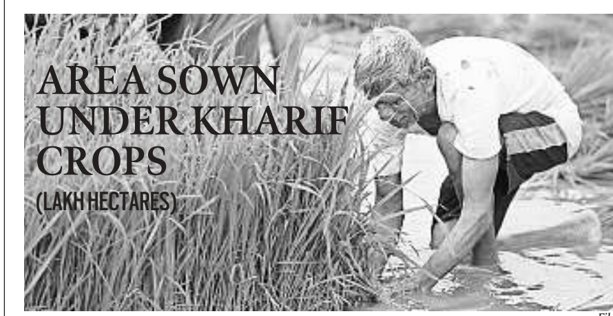
AREA SOWN UNDER KHARIF CROPS (LAKH HECTARES)

More important, as many as 24 out of the country's 36 meteorological subdivisions recorded precipitation shortfall in excess of 10 per cent. The rains have, however, been 41.9 per cent above average