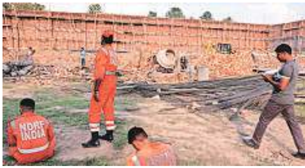
Eight people were injured after the wall at the under-construction godown collapsed in Alipur, Friday. Amit Mehra

FIVE LABOURERS were killed and eight injured after the wall of an under-construction godown collapsed in Outer North Delhi's Alipur Friday. Police and MCD said the construction was illegal and they had issued orders against it in April-May but the builder restarted work this month.