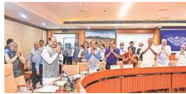
Lok Sabha Speaker Om Birla with presiding officers from state Assemblies in New Delhi on Friday.