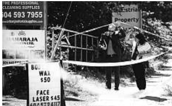
Investigators arrive at the shooting site in Surrey, British Columbia, Thursday.

Surrey Royal Canadian Mounted Police (RCMP) said a "man shot at that location around 9:30 am succumbed to his injuries