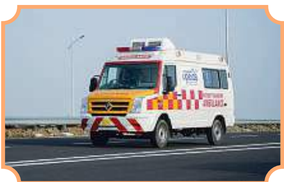
24x7 Medical Assistance