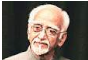
Hamid Ansari, former Vice President.