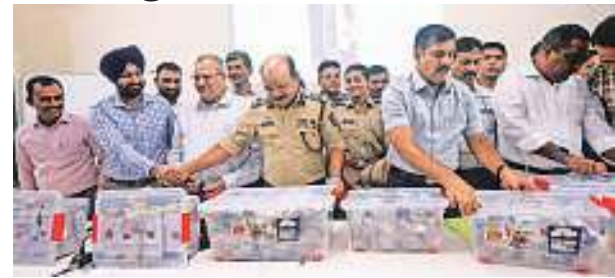
The seized drugs on Friday.