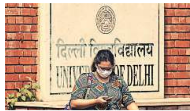
Delhi University, which was at rank 12 last year, has slipped one spot to rank 13 this year.