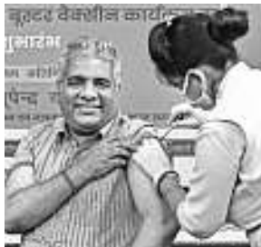
Union Minister Bhupendra Yadav gets the booster shot in New Delhi, Friday.

In comparison, only 5.5 lakh precaution doses were administered each day on an average over the past seven days. The uptake has been slow ever since it was opened up for healthcare work-