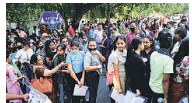
Students wait outside a centre before the exam.