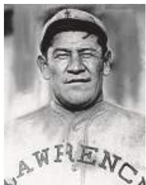
Jim Thorpe; (right) the star athlete sets a fast pace for girls during a 'junior olympics' event in Chicago in 1948.