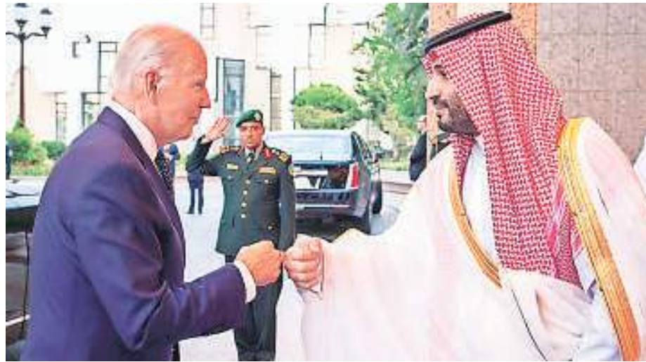
Saudi Crown Prince Mohammed bin Salman greets Joe Biden in Jeddah, Friday.

The last serious round of negotiations aimed at creating an independent Palestine broke down over a decade ago.