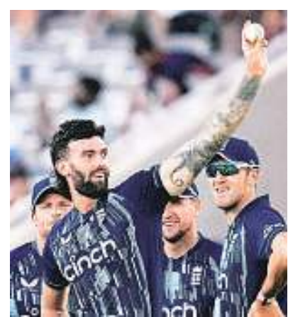
England's Reece Topley celebrates after taking his fifth wicket.

He thought of retiring — he was just 25 then and had the assurances of the England selectors that he would be in the loop, for his gifts were rare — before he changed his mind and took a year's sabbatical. He took his thoughts away from cricket and sought the solace of music and friends. He had friends in the music industry and he soon began to hang around with a studio at Peckham, where he polished his drumming skills and learned ukulele, a guitar-like instrument. "I have friends in the music industry, they felt it was a real kick in the teeth when a friend suggested they should all think about retraining. It's definitely nice that I've got friends who do different things. A lot of them work in the city and it does give you a differ-