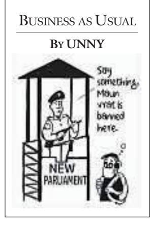
BUSINESS AS USUAL