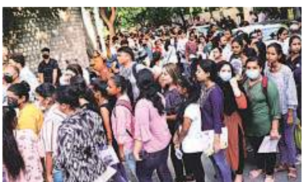
Aspirants at Delhi University on Friday. PAGE 8