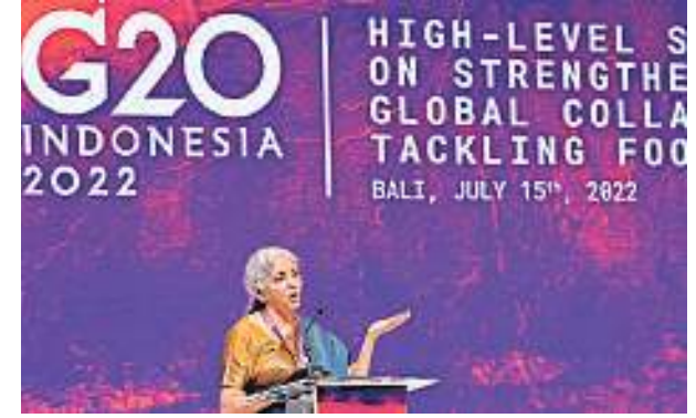
Finance Minister Nirmala Sitharaman during a seminar on the sidelines of the G20 Finance Ministers and Central Bank Governors Meeting in Bali, Indonesia on Friday.