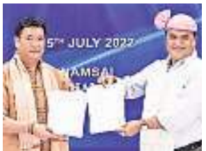
Assam CM Himanta Biswa Sarma with his Arunachal counterpart.

As per the declaration, both the states will now constitute 12 regional committees, each for