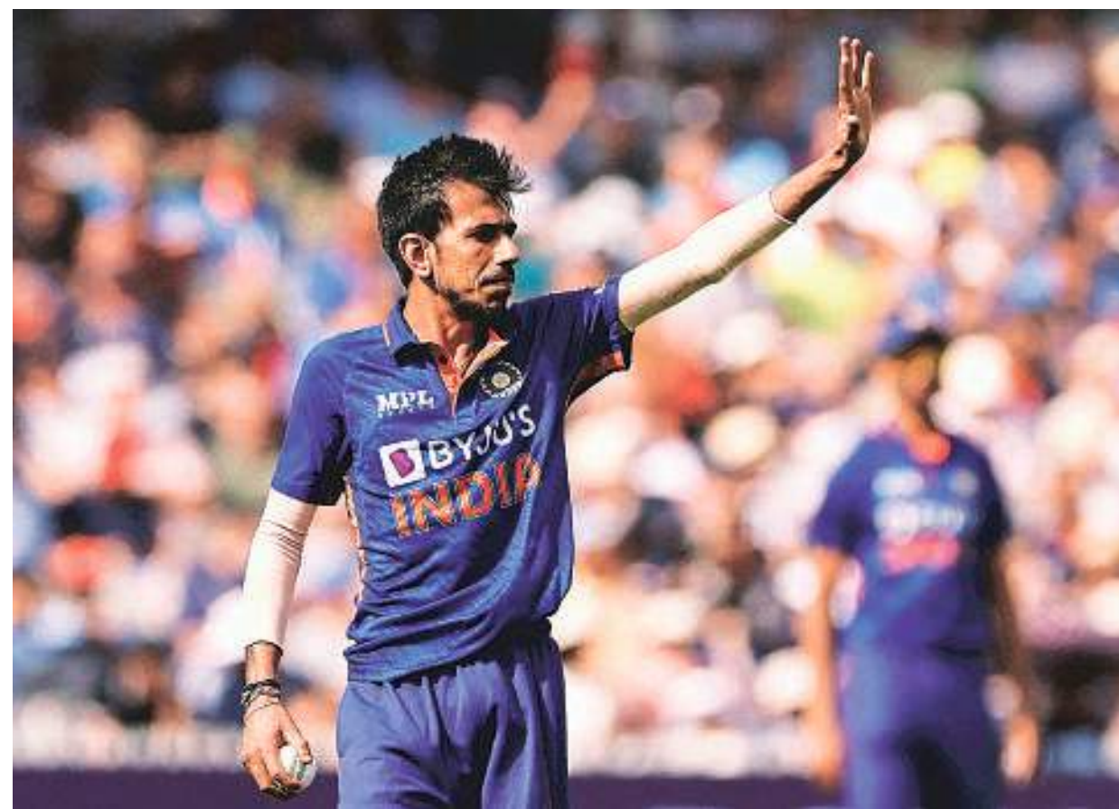
All four of Yuzvendra Chahal's wickets at Lord's were bargained in the process of batsmen sweeping, including Joe Root's.

So he was ready when England came out sweeping, reverse-sweeping and slog-sweeping. All four of his wickets at Lord's — another justification of his prowess abroad — were bargained in the process of batsmen sweeping (Joe Root) or reverse-sweeping (Ben Stokes) or slog-sweeping (Jonny Bairstow and Moeen Ali) him. When a batsman perishes attempting any of these strokes, he alone is often considered guilty, as if every unsuccessful sweep is an act of self-destruction. Bowlers seldom get appreciated for the subtle changes they had imparted. Like when Chahal undid Root, a refined expo-