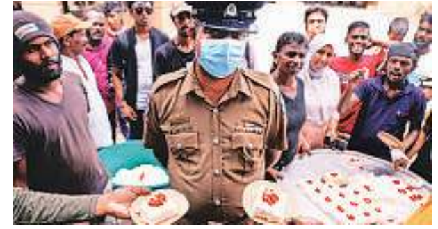
Celebrations in Colombo over Gotabaya's resignation.

"Killing terrorists is acceptable," he says, "We do appreciate