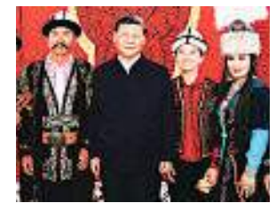
Xi Jinping with artists in Urumqi, Xinjiang.

Jinping visited Xinjiang in the country's northwest this week