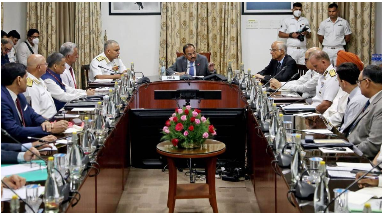
National Security Advisor Ajit Doval chairs the inaugural meeting of the Multi-Agency Maritime Security