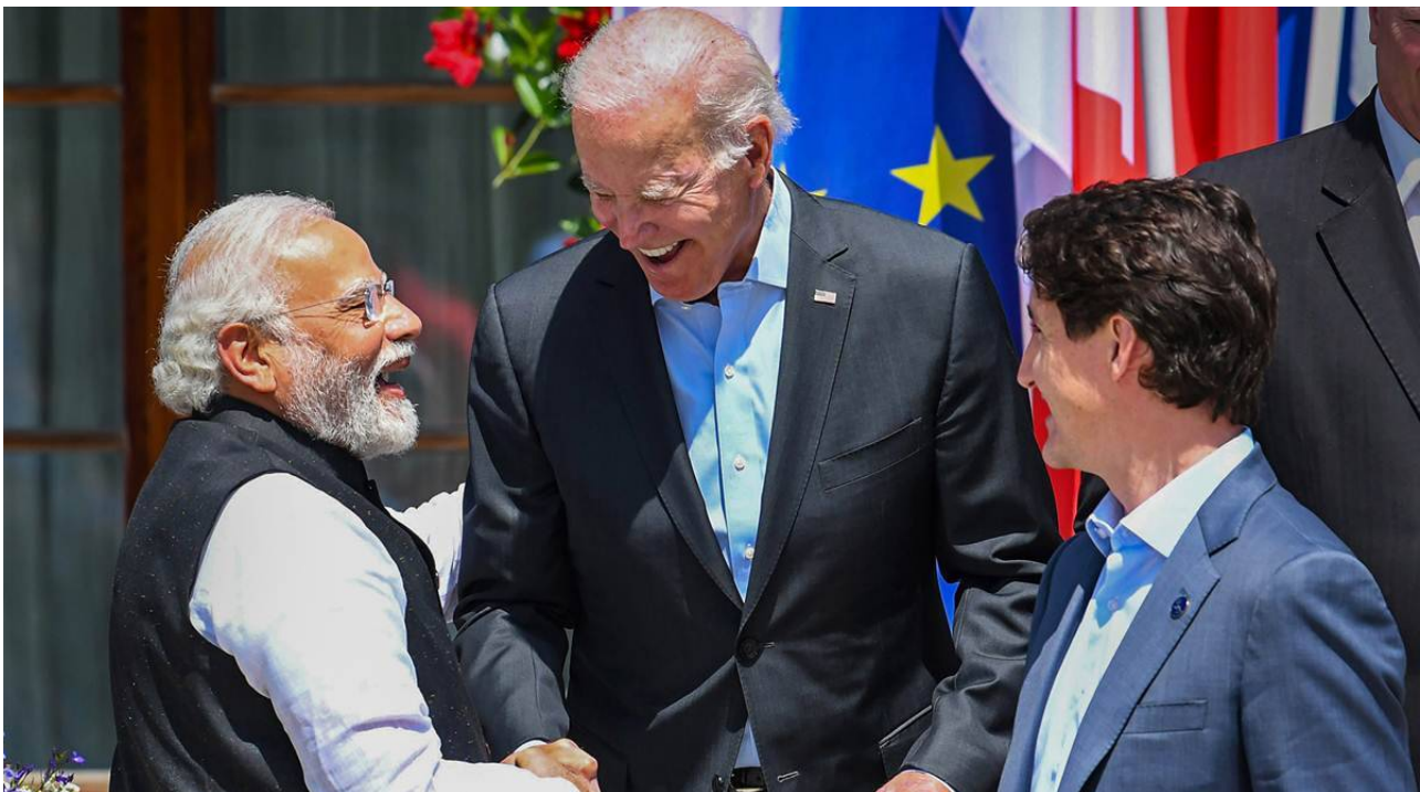
PM Narendra Modi, US President Joe Biden, Canada's PM Justin Trudeau at the G7 meeting at Schloss Elmau Castle, Germany, on Monday.