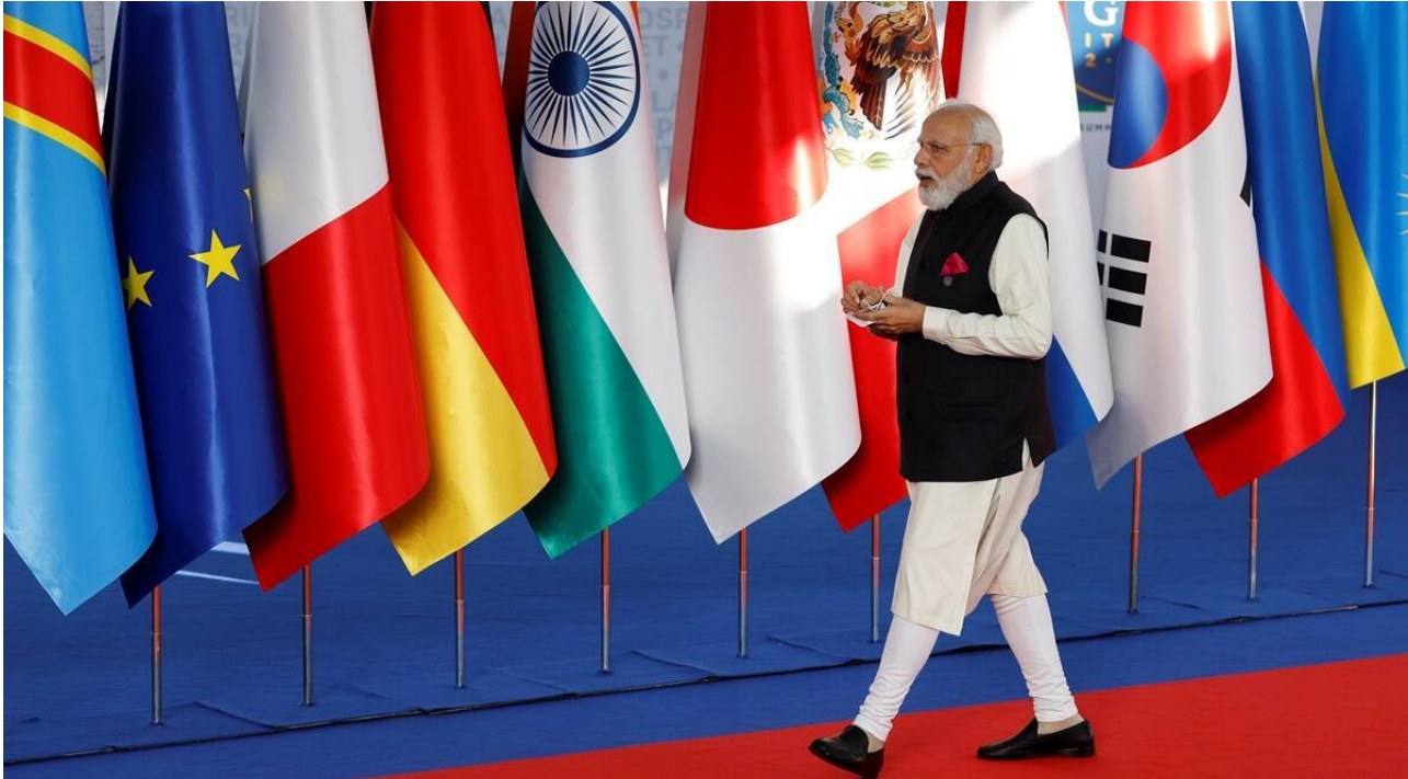
PM Narendra Modi at the G20 summit in 2021. (File)

Ahead of his departure to Germany for the G7 summit, Prime Minister Narendra Modi on Saturday said he will exchange views with the leaders of the grouping and