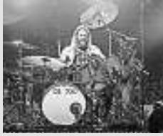
Taylor Hawkins.