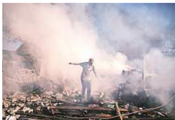
Debris of a burning house, destroyed after a Russian attack in Kharkiv, Ukraine.

Spain and Portugal did secure permission to implement temporary measures to curb their electricity prices.