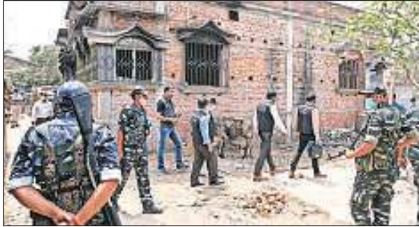
CFSI experts collect samples in the presence of CBI officers at Bogtui village in Birbhum district, Saturday. Partha Paul

forensic experts stayed for hours inside the charred house from where seven bodies were recovered. They used a 3D scanner machine and collected samples from the house and other dwellings that were set afire.