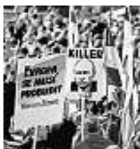
Anti-war protests in Prague. Reuters

Thousands of Russians marched through Prague on Saturday, waving the white-blue-white flag that has become a symbol of protests against Moscow's invasion of Ukraine. Carrying signs that read "Killer" over a picture of President Vladimir Putin and chanting "No to War", protesters walked from Prague's Peace Square through the centre of the Czech capital. Police put the number of marchers at about 3,000. Reuters