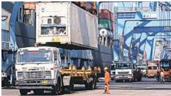
JNPT port, near Mumbai. Key exports to Australia include petroleum products, pharma products and gems & jewellery. File

At the start of trade negotiations, Commerce Minister Piyush Goyal had announced that the two countries were aiming to conclude an interim or early harvest trade deal by December 2021. In a joint statement issued by India and Australia on Monday, both Prime Minister Narendra Modi and Australian Prime Minister Scott Morrison "re-committed to concluding an Interim CEA (Comprehensive Economic Cooperation Agreement) at the earliest," and a full fledged agreement by the end of the year. India has been pursuing early harvest agreements in FTA talks as a way to address easy issues in trade first, so industry can start benefiting