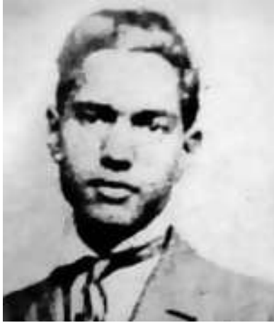
Bhagat Singh (left); and Kartar Singh Sarabha, hanged at the age of 19

Party, that was formed on July 15, 1913, with the express aim of overthrowing the British government in India. Sarabha, who had by then left studies, was its youngest founding member.