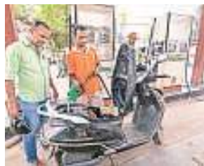
A pump in Guwahati. Auto fuel prices were raised by 80p each on Saturday.

All the four increases since the ending of a four-and-half-month long hiatus in rate revision on March 22, have been of 80 paise a litre. These increase increases are the steepest single-day rise since the daily price revision was started in June 2017.