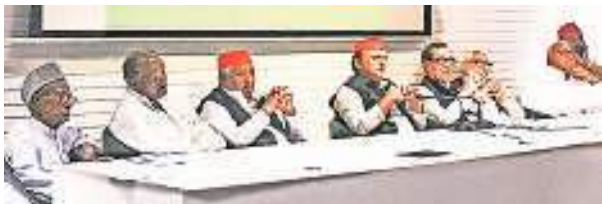
Akhilesh Yadav with newly elected SP MLAs.

“Akhilesh Yadav, a member of the UP Legislative Assembly and leader of Samajwadi Party is ap-