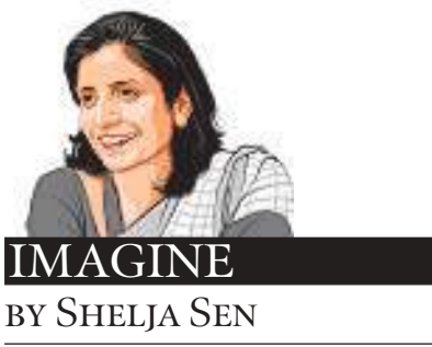
IMAGINE BY SHELJA SEN

We are not just accountable for our children, we have to be accountable to them