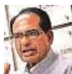
Madhya Pradesh CM Shivraj Singh Chouhan

The campaign paid off as the BJP returned to power in UP in a convincing fashion. Now, the sobriquet seems to have found a space in the political discourse in Madhya Pradesh as the saffron