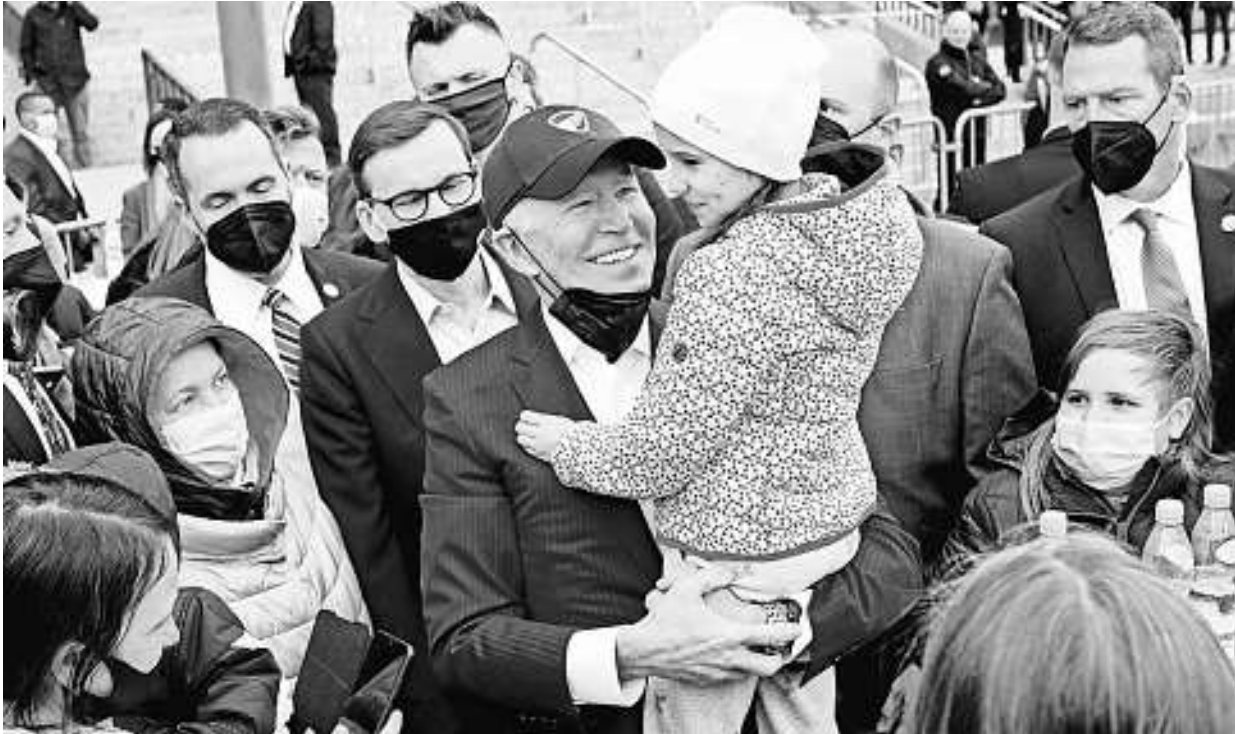
US President Biden meeting Ukrainian refugees in Warsaw on Saturday.

"In this battle we need to be clear-eyed. This battle will not be won in days, or months, either," Biden said. The crowd of about 1,000 included some of the Ukrainian refugees who have fled for Poland and elsewhere in