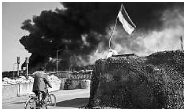
On the outskirts of Kyiv on Friday following a Russian attack.