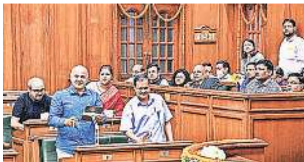
Chief Minister Kejriwal, Deputy CM Sisodia at the Delhi Assembly on Saturday.