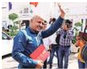
Sisodia at Vidhan Sabha to present the Delhi budget 2022-2023.