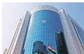
Sebi building, Mumbai. As per the regulator, the changes would be 'investor friendly'.

As per Sebi, the changes would be "investor-friendly".