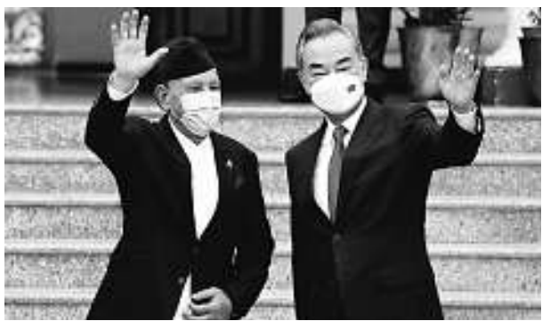
Nepalese foreign minister Narayan Khadka, left, and Chinese Foreign Minister Wang Yi in Kathmandu on Saturday.

Council, said the country was prepared to use nuclear weapons against the US and Europe if its existence was threatened. Russia's defence minister, Sergei K. Shoigu, also mentioned Russia's nuclear weapons in remarks released on Saturday.