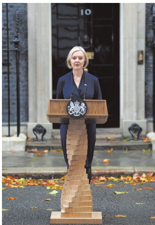
Short term: Truss makes statement outside 10 Downing Street.

Speaking from behind a lectern outside No.10 Downing Street, where only 45 days ago she had stood, having just been appointed Prime Minister by the late Queen Elizabeth II, Ms. Truss announced her decision to a country that has been through a sum-