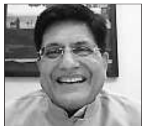
Commerce Minister Piyush Goyal at the mid-term review of exports, Saturday.

He also said that India is negotiating free trade agreements