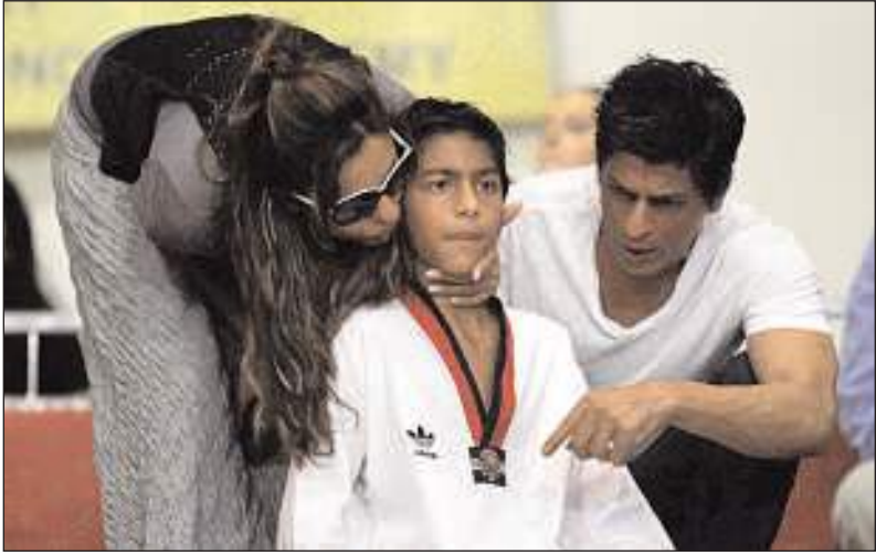
As parents, we know as well as SRK that there are no fingers to point, no stones to be cast. Any one of ours can be the next Aryan, without the searing spotlight

He was what most of us were in our own lives, without the charm, the dim-