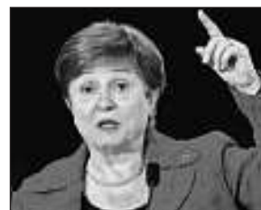
IMF MD Kristalina Georgieva

Washington: The International Monetary Fund's executive board ended a five-hour meeting about the future of Managing Director Kristalina Georgieva without a decision on Friday, saying it would seek more information about claims she pressured World Bank staff to alter data to benefit China in her previous role. REUTERS