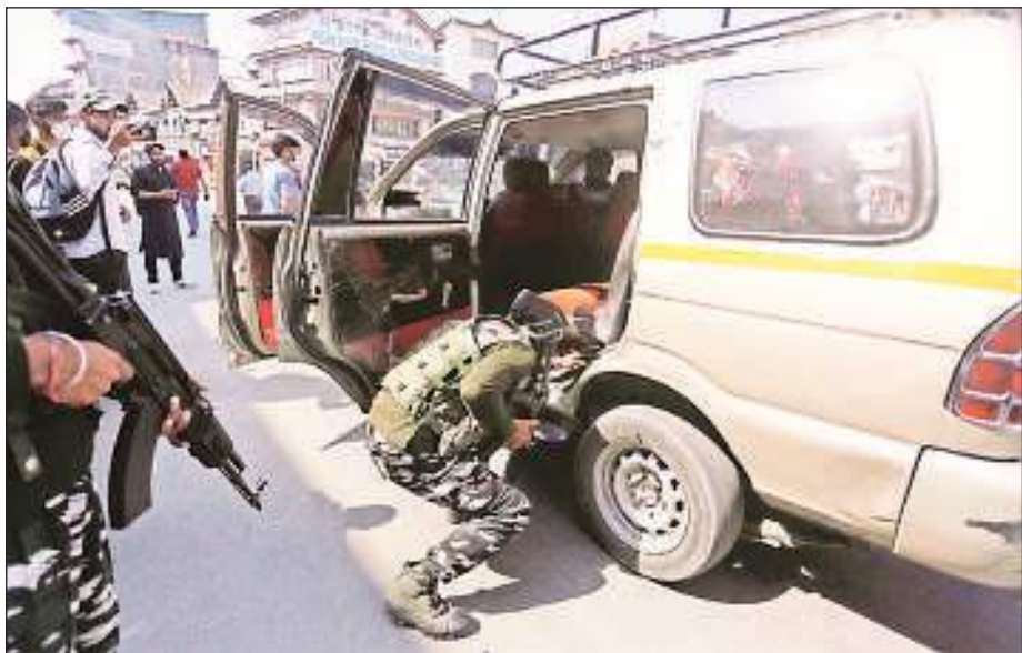
AFTER THE ATTACKS: Security personnel check vehicles in Srinagar on Saturday.

rampage, pelting stones at police, causing extensive damage to property, and raising communally charged slogans. More than a dozen civilians and police person-