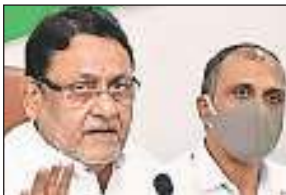
Maharashtra minister Nawab Malik.

Reacting to Malik's allegations, the BJP said the NCP minister "seems to be playing the role of an advocate, defending the accused".