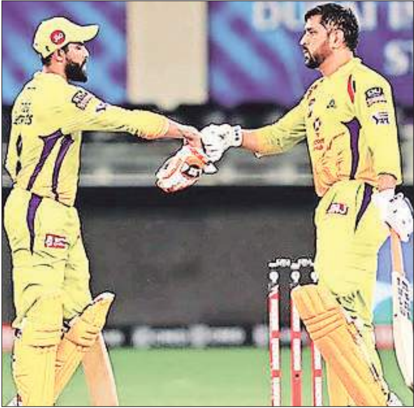
Ravindra Jadeja towers the Chennai Super Kings batting charts with a 145.51 strike-rate, while MS Dhoni with 95.04 pales in comparison. In the 14 league games, Jadeja scored 227 runs and his captain 96 runs.

CSK's batting this term has been mainly carried by their openers Ruturaj Gaikwad and Faf du Plessis - with 533 and 546 runs respectively. In the first half of the tournament in India, Moeen Ali made his presence felt at No. 3. But in the second phase in UAE, especially towards the back-end of the group stage, the southpaw's form regressed. Ali hasn't reached a 30-plus score in his last four innings.