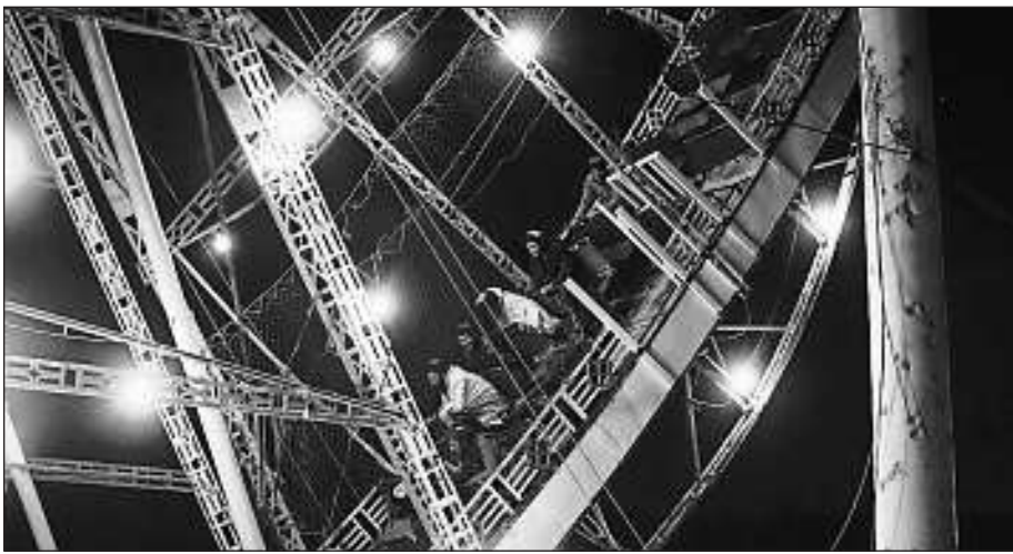
Taliban fighters sit on a ride at an amusement park at Kabul's Qargha reservoir, on Friday.

The CDC must also detail rules for exceptions, which include children not yet eligible for shots, as well as for visitors from countries where vaccines are not widely available. The administration must also decide whether to admit visitors part of Covid-19 clinical trials or have recently contracted Covid-19 and are not yet eligible for vaccination. REUTERS