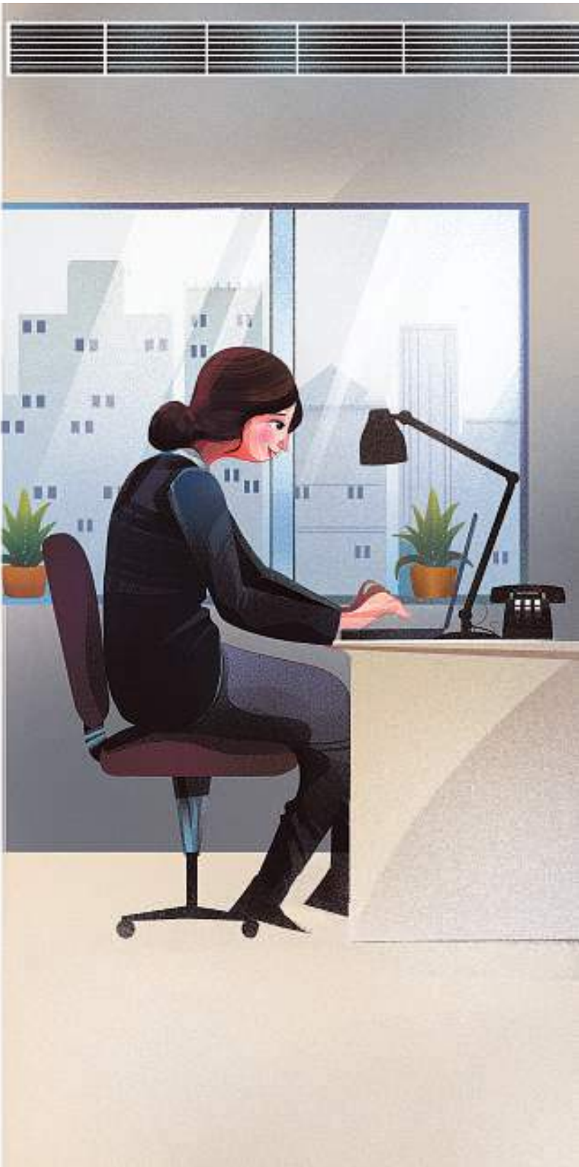
ILLUSTRATION: SUVAJIT DEY