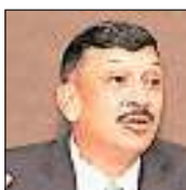
CBI Director Subodh Jaiswal

A senior officer from the Mumbai Police Crime Branch said Jaiswal has been summoned by the BKC cyber police station on October 14. In the past, a team from the cyber police station had gone to Hyderabad to record the statement of senior IPS officer Rashmi Shukla in connection with the case. The BKC cyber police had registered an FIR against unknown persons earlier this year after it came to light that some confidential call recordings, purportedly of IPS officers lobbying for posts, have