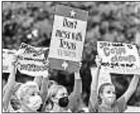
At a women's march in Austin, Texas, last week.

"Patients are being thrown back into a state of chaos and fear,"