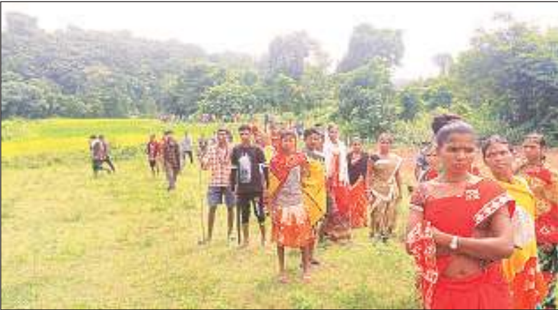
Villagers at Edesmetta, where almost everyone has had malaria at least once. “Who likes feeling sick?” says one of them.