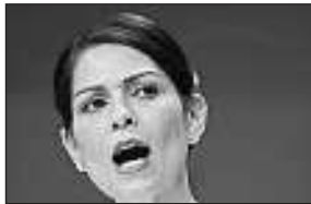
UK Home Secretary Priti Patel

In a separate statement, Taiwan's China-policy making Mainland Affairs Council called on Beijing to "abandon its provocative steps of intrusion, harassment and destruction" and return to talks. REUTERS