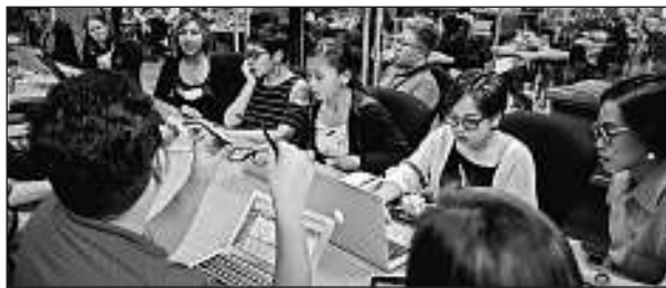
Rappler staff in their office in Manila in 2018.