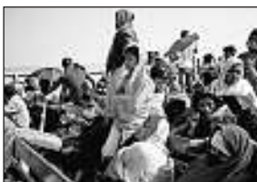
Rohingya refugees being taken to Bangladesh's Bhasan Char island last Dec.

The Bangladeshi government has moved nearly 19,000 Rohingya refugees to Bhasan Char island from border camps despite protests by some refugees and opposition from rights groups, who say the low-lying island is vulnerable to flooding and storms. Authorities in the densely