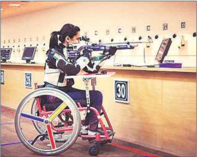
Avani Lekhara, the 10m air-rifle winner, became the first-ever Indian woman to win a gold in the Paralympics. (Below right) A young Avani getting a prize for a dancing competition before the accident.