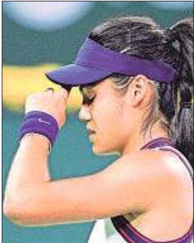
Raducanu lost 6-2, 6-4 in the second round, ending her 10-match winning streak that began in New York

of favouring Fury. He came into the fight with an injured bicep. The elaborate 40-pound costume for his ring walk was "too heavy" and he "didn't have no legs from the beginning of the fight". His trainer betrayed him and was part of a conspiracy by throwing in the towel as he was "influenced" by Fury's camp. His water was spiked, "as if I took a muscle relaxer". And lastly, that Fury's gloves were loaded. The pandemic and the many failed negotiations with Wilder's camp delayed the third fight. Fury's team, meanwhile, began working towards the all-important, title unification fight against Joshua — the then WBA (Super), IBF, WBO, IBO, WBC, The Ring and lineal champion. In March, the two-fight deal to crown the undisputed champion was signed. But after his rival's "massive announcement" video on Twitter, the 35-year-old sprang to action. Wilder's camp argued that their fighter had a contractual right to a third fight, taking the matter to an independent arbitrator, who ruled in May that Fury had to fight Wilder by September 15. The fight was then moved to July, before Fury and his team members tested positive for the coronavirus. LIVE ON: Voot Select: 9 am