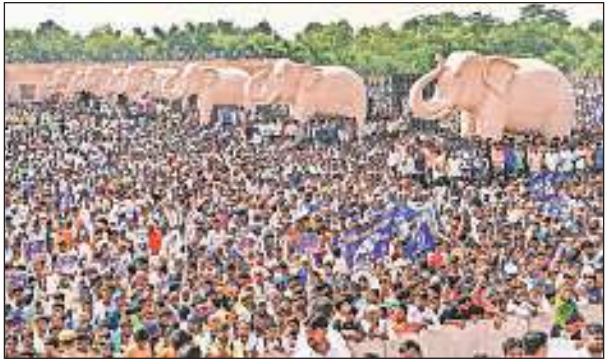
A BSP rally in Lucknow on Saturday.