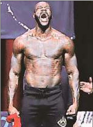
Deontay Wilder at the weigh in before the heavyweight division WBC championship fight against Tyson Fury in Las Vegas.

Fury's lineal title was the most obvious, but Wilder had other reasons to face Fury. The American was in line to fight Fury before the latter's hiatus. But more importantly, the champion was still looking to make a name.