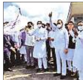
Thackeray flagged off the first flight from Sindhudurg airport on Saturday.

The inauguration of Chipli airport was held in a hybrid mode with Thackeray flagging off the first flight to Mumbai. Union Civil Aviation Minister