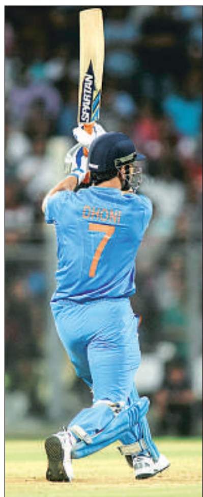
Sunil Gavaskar has informed the MCA that the spectator who caught the ball happens to be an acquaintance of his friend.

FORMER INDIA captain Sunil Gavaskar has come forward to help the Mumbai Cricket Association (MCA) locate the ball which disappeared into the stands on the historic night India won its second ICC World Cup in 2011.