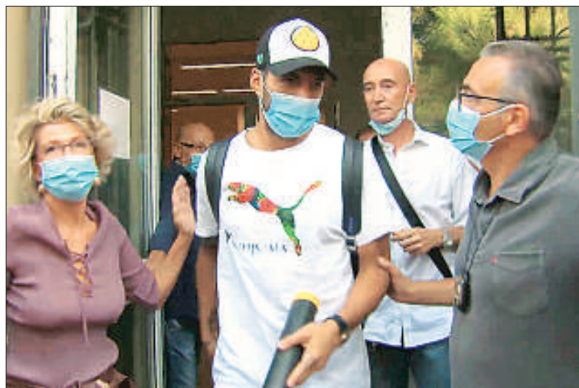
Luis Suarez leaves the University for Foreigners after taking an Italian citizenship test in Perugia, Italy on September 17.

ITALIAN PROSECUTORS said on Tuesday they had evidence that the language exam taken by Barcelona's Uruguayan striker Luis Suarez to obtain Italian citizenship ahead of a possible move to Juventus was rigged.