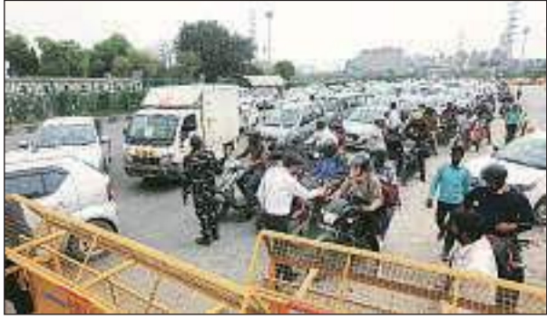
Borders were sealed in Gurgaon earlier. 70% of Haryana's cases are in Gurgaon, Faridabad, Sonapat and Jhajjar.

IN THE wake of increasing Covid-19 cases in districts bordering Delhi — Gurgaon, Faridabad, Sonapat and Jhajjar — the Haryana government has decided to completely seal even village roads and inner roads connecting these districts with the national capital.