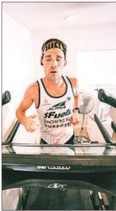
Ultra runner Zach Bitter during his successful attempt to break the 100-mile treadmill record.

At one point, the air-conditioner stopped working and the display on the treadmill blanked out briefly because the room was drawing too much power with multiple appliances and devices running - treadmills, fan, AC, camera set-up. Fortunately, using an extension cord to