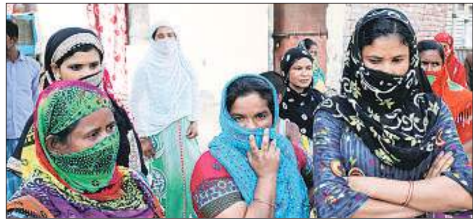
Women who work as domestic helps in nearby housing societies at Sarfabad village.